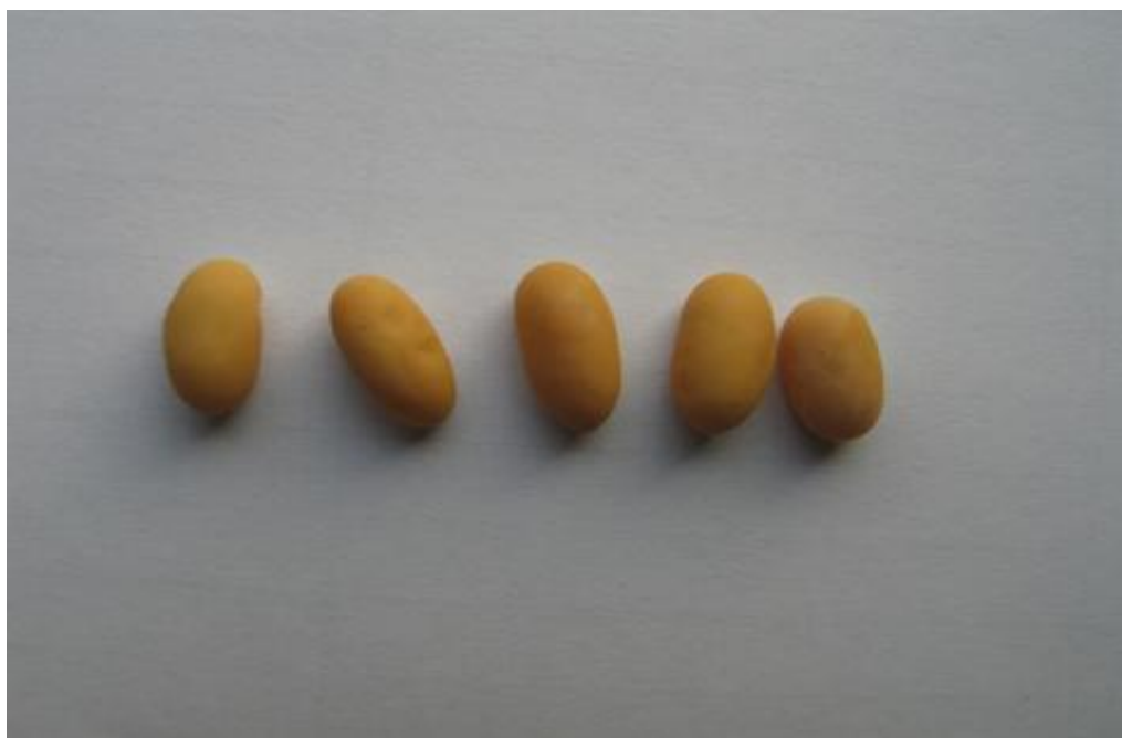
FIG. 4.- The eggs of Eremias trauchi trauchi .