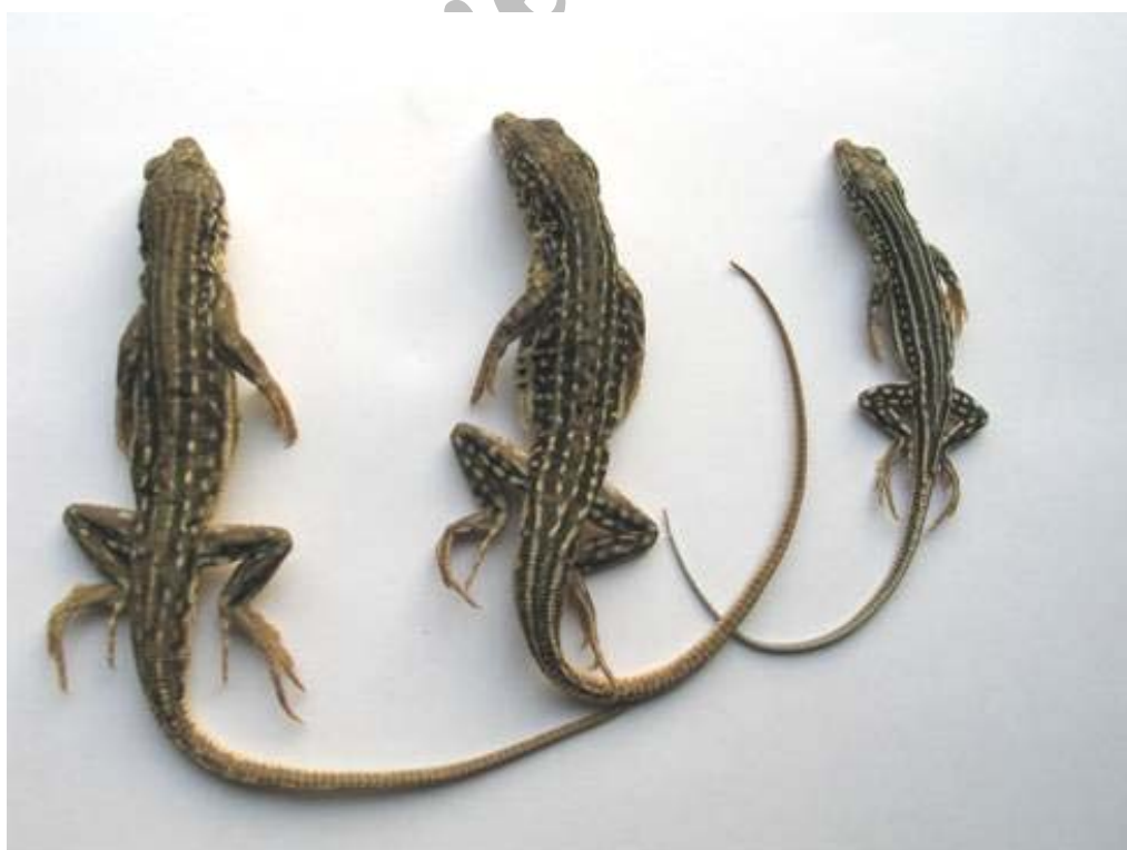
FIG.2.- Color pattern in Eremias trauchi trauchi one juvenile (right) and two adults (left)