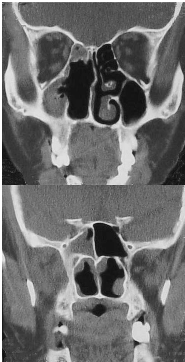
Figure 1. Coronal computed tomography scan with opacification of the left-sided sinuses (maxillary, ethmoidal, and sphenoidal).

Radiography of the paranasal sinuses revealed opacification of the left ethmoidal and maxillary sinuses. Therefore, the patient was treated with ceftriaxone and metronidazole. On day 6, he had worsening of his headache and left facial and orbital pain. Brain computed tomography (CT), electroencephalography, and neurological and ophthalmologic examination did not show any abnormality. On day 10, the patient became febrile (temperature, 38°C) and cytomegalovirus antigen became positive. Ganciclovir, 250 mg/d, was started on and cyclosporine and