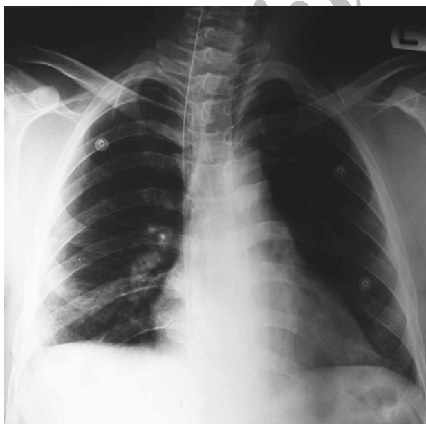
Figure 1. Chest radiography shows guide wire in the inferior vena cava extending into the superior vena cava and then the right internal jugular.

Four hours after dialysis, the patient's abdominal pain aggravated. Blood pressure dropped to 78/48 mm Hg. On examination, there was rebound tenderness over the abdomen. Hemoglobin level was 6.4 g/dL. Plain abdominal and chest radiographies revealed the guide wire left in the right femoral vein, while the tip of the catheter was in the jugular vein (Figures 1 and 2). With the diagnosis of acute abdomen, the patient underwent abdominal exploration, which showed retroperitoneal bleeding and hematoma. No visible leakage or venous lesions were detected. Thus, no obvious cause of bleeding was confirmed, but it was deemed to be due to a very subtle perforation during the procedure which was not visible. It was impossible for the surgeon to take the guide