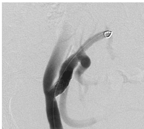
Figure 1. Digital subtraction angiogram showed successful stent deployment at the surgical anastomosis of the renal transplant artery with the external iliac artery.

Examination with Doppler ultrasonography showed improved blood flow within the transplant kidney. The drain was kept in for 4 days. Serial follow-up Doppler ultrasonography showed