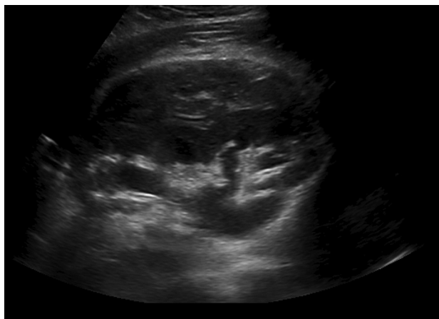
Figure 2. Longitudinal ultrasonography image of the transplant kidney showed a large 10 × 3.1-cm subcapsular hematoma situated anterior to the kidney. Note is also made of the prominent collecting system, which is secondary to the distended bladder (seen inferior to the kidney).

reducing pressure effect of hematoma on the kidney and good vascular perfusion with resistive index values of 0.57 to 0.64. The PSV at the transplant artery anastomosis site was measured between 340 cm/sec to 440 cm/sec, with a PSV in the external iliac artery of 380 cm/sec. His serum creatinine concentration started to decrease, following the successful stent insertion. Six months after stenting, his serum creatinine decreased to 189 μmol/L. Figure 3 shows the change in his serum creatinine concentration since the time of transplant. The most recent serum creatinine level, 2 years after transplantation as 164 μmol/L, and the glomerular filtration rate was estimated to be 45 mL/min.