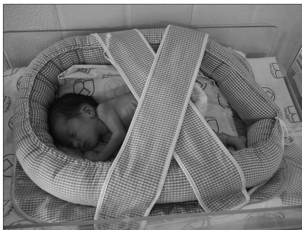
Figure 2: Nested infant