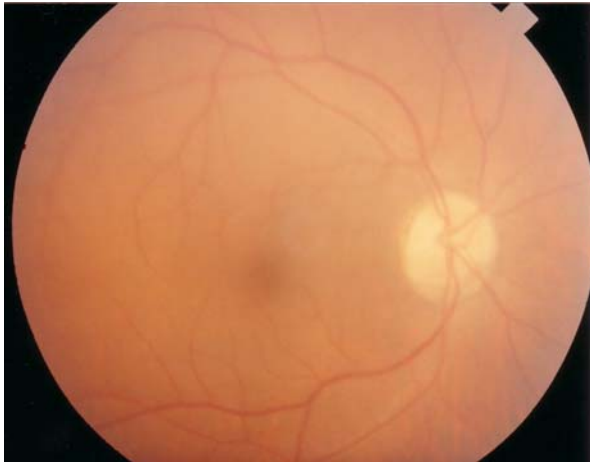
Figure 1 Fundus photograph of the right eye at presentation.