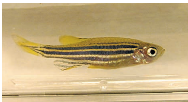
Figure 2. The zebrafish, Danio rerio , is an important vertebrate model organism in eye research.

photoreceptor activity in the larval fish.