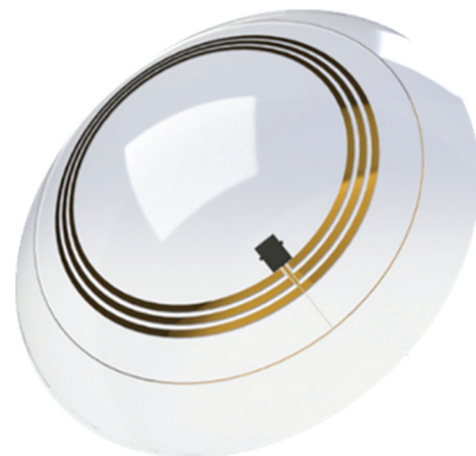
Figure 3. Diagram of a contact lens IOP sensor that includes a strain gauge sensor placed circumferentially, an antenna for telemetry and wireless powering, and a microprocessor. IOP, intraocular pressure