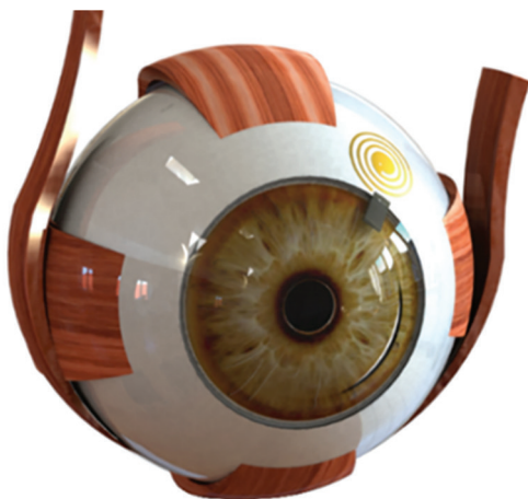
Figure 2. A three-dimensional model of the eye showing an implantable capacitive IOP sensor integrated into the anterior chamber; the antenna of the sensor is placed in the sclera. IOP, intraocular pressure

Most IOP sensors are based on MEMS technology. However, several microfluidics-based systems have also