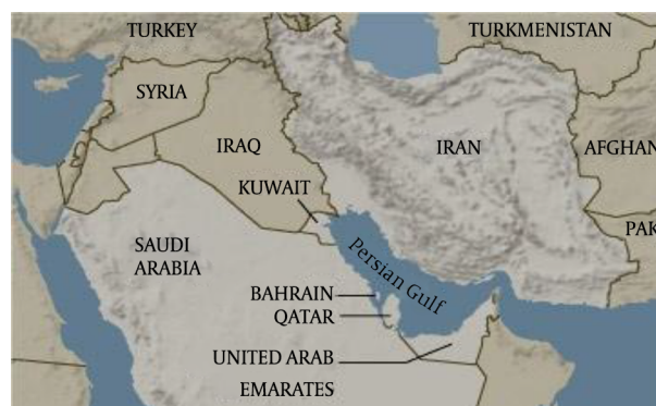
Figure 1. Arab States in Southwest Asia

According to the recent world population reviews, the states have minorities of Arab or Arabic-speaking nationals. However, there are a number of expatriate workers in the states (Figure 2). Expatriates in the states are mainly temporary workers from India, Pakistan, Southeast Asia,