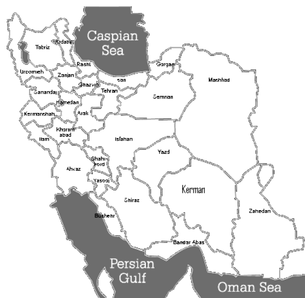
Figure 1. Provincial map of Iran

tumor suppressor gene, located on the long arm of chromosome 17 and contains 23 exons coding a 1863 amino acid polypeptide [8]. It has observed that BRCA1 plays an important role in regulating the actions of RAD51, an essential protein for strand invasion in homologous recombination repair [9]. A specific regulation of homologous recombination by BRCA1 might maintain genomic integrity and suppress tumor development in proliferating cells [10].