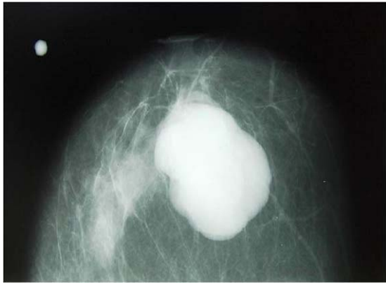
Figure 1. Right craniocaudal mammogram shows a dense mass with a lobulated well-defined margin.