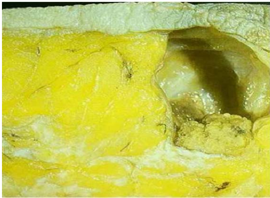
Figure 3. Photograph of a gross specimen shows a lobulated mass with branching and irregular surface within a cystic space.