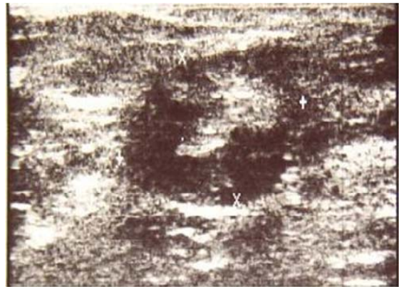
Figure 2. Sonogram shows a cystic mass with an intracystic solid component and echogenic internal septa.