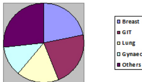
Figure 2. Site distribution of secondary malignancy

between synchronous or metachronous has taken as 6 months as reported by several authors [8, 12, 13].