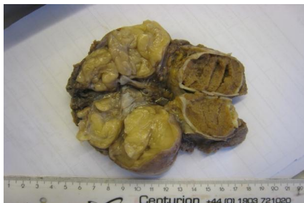
Figure 2. The tumor was creamy yellow, lobulated soft tissue that attached to the left testis without necrosis or hemorrhage.