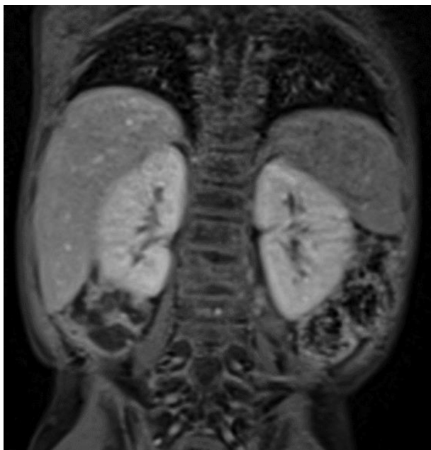
Figure 3. Disappearance of yolk sac tumor at the end of chemotherapy with bleomycin, etoposide, and carboplatin (JEB regimen); magnetic resonance imaging.

The most common pathologic pattern seen in YST tumor is microcystic structure, which is characterized by the presence of a spider-web like network shaped by vacuolated cytoplasm of tumor cells. In addition to Alpha-fetoprotein, the main tumor marker for YST, Cytokeratin is present in almost all the cases, and vimentin and placental alkaline phosphatase (PLAP) can be positive in several different subtypes of germ cell tumors (5, 9).