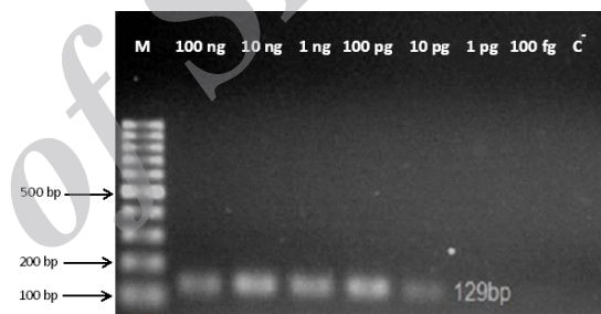
Fig. 2. The results of the PCR on serial dilution of external positive control. These data showed LOD of the assay equal to 10 pg/ \mu l.