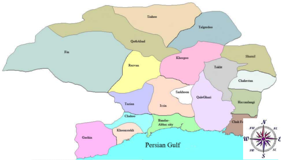
Fig. 1. Malaria registration centers of Bandar Abbas, Hormozgan Province, Iran, Bandar Abbas County