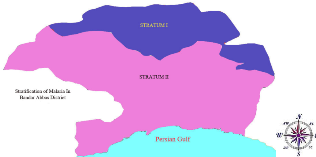
Fig. 3. Malaria stratification in Bandar Abbas, Hormozgan Province , Iran 2004–2008, Bandar Abbas County