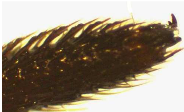
Fig. 4. Presence of one row comb-like hair under the fourth tarsus of Latrodectus hasselti