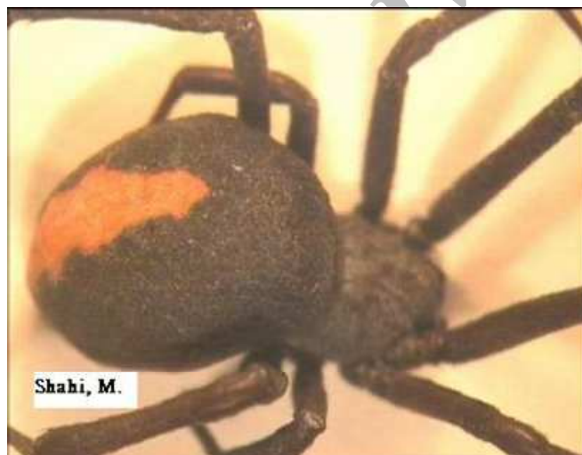
Fig. 2. Red-back spider collected from Bandar Abbas City, Iran, 2007