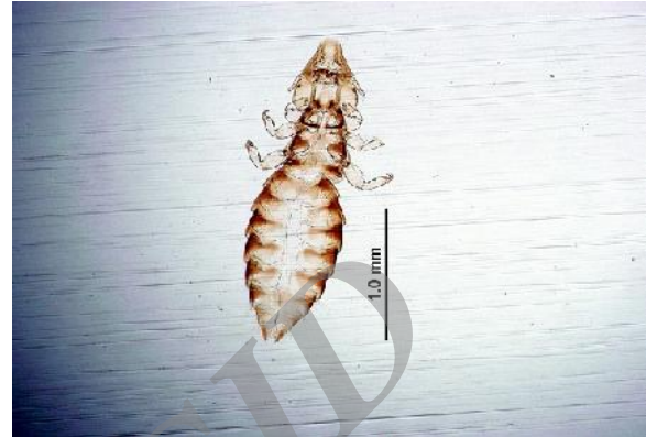
Fig. 1. Aquanirmus podicipis , adult female, host: Podiceps cristatus (Great Crested Grebe) (original)

Grebe: Podiceps cristatus , Locality: Nashtarood City, Mazandaran Province. This species is reported for the first time in Iran (Fig. 12, 13).