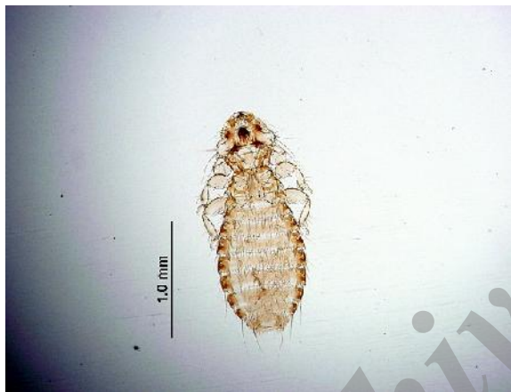
Fig. 12. Pseudomenopon dolium , adult female, host: Podiceps cristatus (Great Crested Grebe) (original)