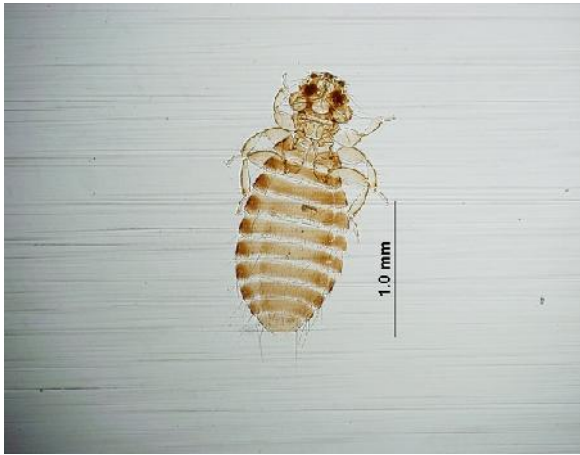
Fig. 4. Ciconiphilus decimfasciatus , adult female, host: Egretta garzetta (Little Egret), (original)