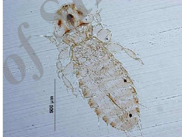
Fig. 13. Pseudomenopon dolium , adult male, host: Podiceps cristatus (Great Crested Grebe) (original)