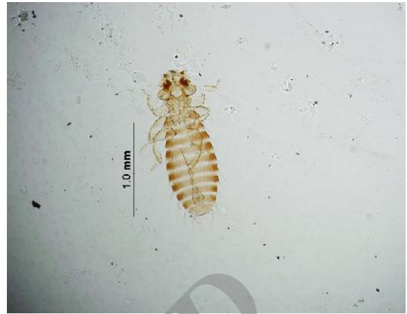
Fig. 5. Ciconiphilus decimfasciatus , adult male, host: Egretta garzetta (Little Egret), (original)