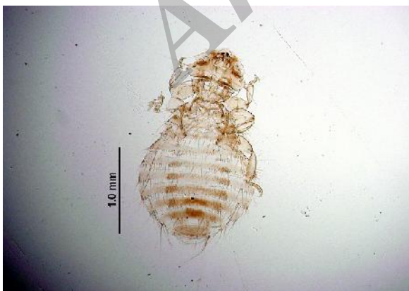
Fig. 8. Hohorstiella lata , adult female, host: Columba livia (Rock Pigeon) (original)