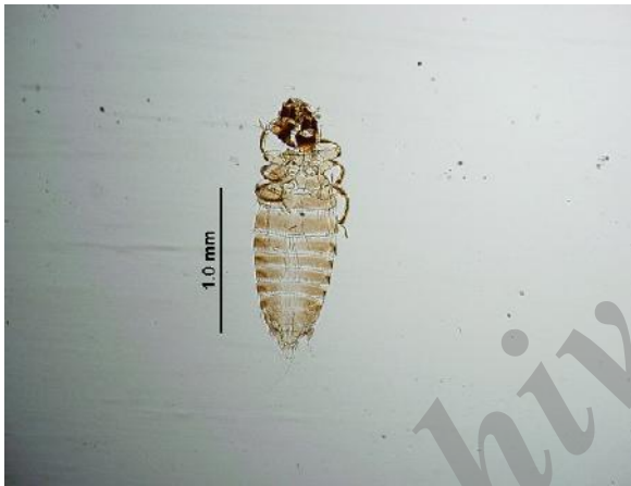
Fig. 6. Colpocephalum turbinatum , adult female, host: Columba livia (Rock Pigeon) (original)