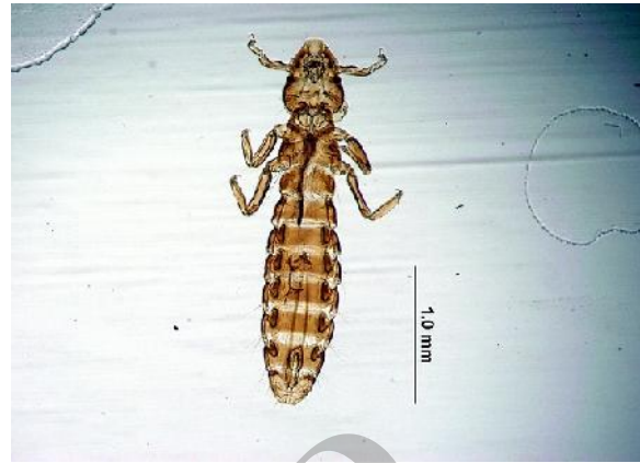
Fig. 11. Pectinopygus gyricornis , adult male, host: Phalacrocorax carbo (Cormorant) (original)