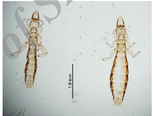
Fig. 7. Columbicola columbae , adult male (left), adult female (right), host: Columba livia (Rock Pigeon) (original)