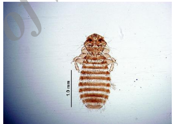
Fig. 2. Austromenopon transversum , adult female, host: Larus ridibundus (Black-headed Gull) (original)