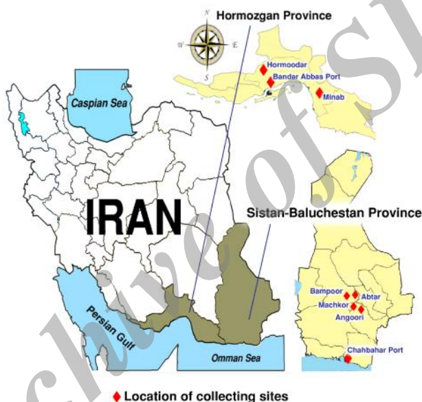
Fig. 1. Location of Anopheles stephensi collection sites from malarious areas of Iran, 2011

* RR50, Resistance Ratio at LC 50 (RR50= LC 50 of field population/ LC 50 of Beech-Lab)