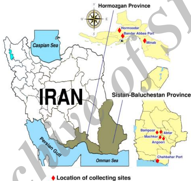
Fig. 1. Location of Anopheles stephensi collection sites from malarious areas of Iran, 2011

* RR50, Resistance Ratio at LC 50 (RR50= LC 50 of field population/ LC 50 of Beech-Lab)