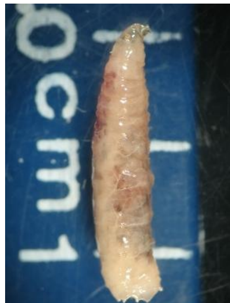
Fig. 2. Macroscopic aspect of a larva