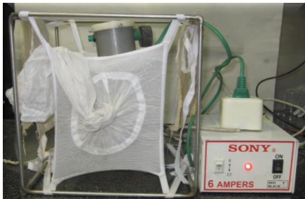
Fig. 2. Mosquito artificial feeding apparatus of based on the idea of Cosgrove et al.