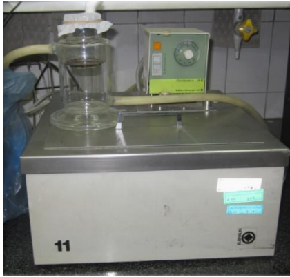
Fig. 1. Tick artificial feeding apparatus

Among the tested membranes, the chicken skin was the best and the heparinized blood had the most efficient because it was not clotted even after 4h. No preference among the tested blood was observed.