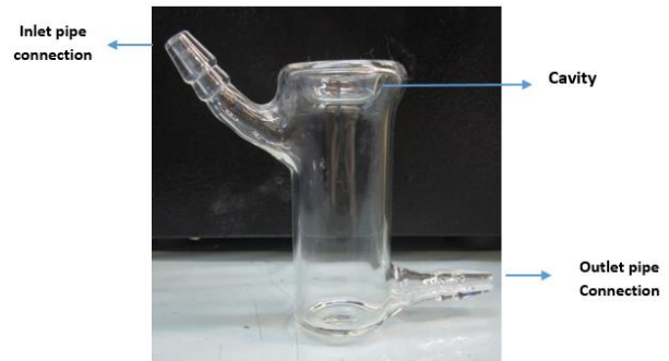
Fig. 4. Glass blood feeder