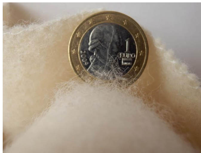
Fig. 1. Photograph of the Oxford fabric showing its fleecy texture. The coin used as a size marker is 23.3mm in diameter