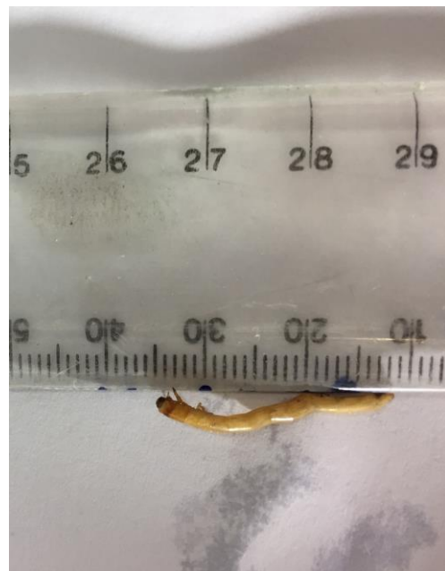
Fig. 2. Macroscopic examination of the larva