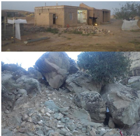
Fig. 2. Different collection methods used for sampling of phlebotomine sand flies, North Khorasan Province, Iran, 2016. Above: white and black Shanon and animal baited traps in location C. Below: Light trap and light trap baited with Carbon dioxide gas in location A