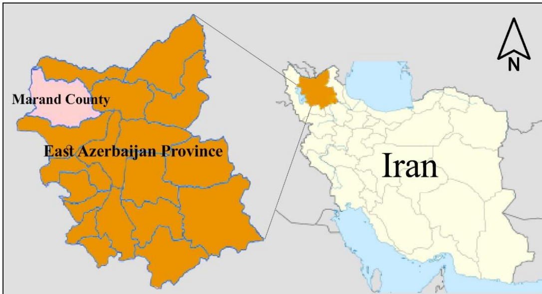
Fig. 1. Map showing Iran, highlighting the location of East Azerbaijan Province and Marand County