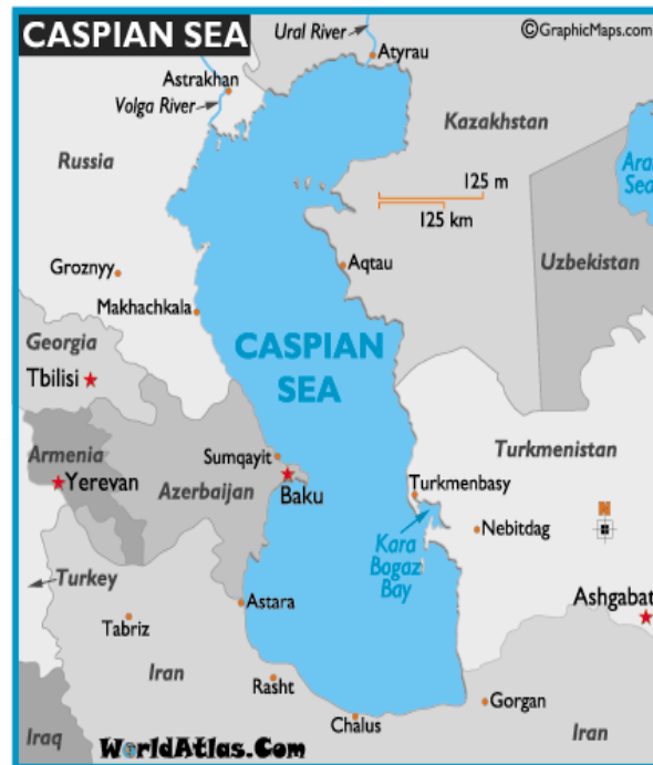
Fig 1. Southeast of the Caspian Sea showing study area