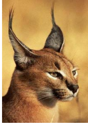
Fig 5. A picture of wild cat roe or caracal ( Caracal caracal ).

In the Sassanid era, the image of hunting rams (Ghirshman, 1962) plays an important role on the golden and silvery containers (Figure 6). For instance, on the silver plates that were found in Daylaman (Guilan province in Iran), Shapur I is seen slaying a red deer ( Cervus elaphus ) (Figure 7) or killing a tiger ( Panthera tigris ) (Figure 8). At the Hermitage Museum (in St. Petersburg, Russia), an image of an onager