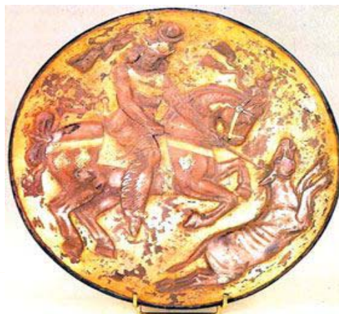
Fig 9. An image of an onager on a silver plate with gold plated (Louvre Museum in Paris, France)

Moreover, other animals like the wild sheep ( Ovis ammon ), wild goat ( Capra aegagrus ), panther ( Panthera pardus ), boar ( Sus scrofa ), pheasant ( Phasianus colchicus ) and partridge ( Alectoris chukar ) can be seen on the plates or Rhytons (in Sassanid