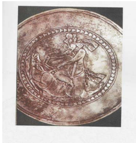
Fig 7. A Silver plate from Daylaman showing Shapur I slaying a red deer