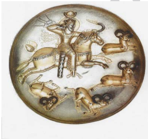
Fig 6. A Silver plate depicting a Sasanian king hunting rams (Metropolitan Museum of art in New York)

( Equus hemionus ) can be seen on a silver plate. Also, this species was found on a silver plate with gold plated in the Louvre Museum in Paris, France (Figure 9). These containers probably have been made in Mazandaran and Golestan provinces (in Iran). In addition, in the early Sassanid era, a Rhyton has been discovered showing a roe deer's head. This Rhyton has been found in Amlash (Ghirshman, 1964) (Guilan province in Iran).