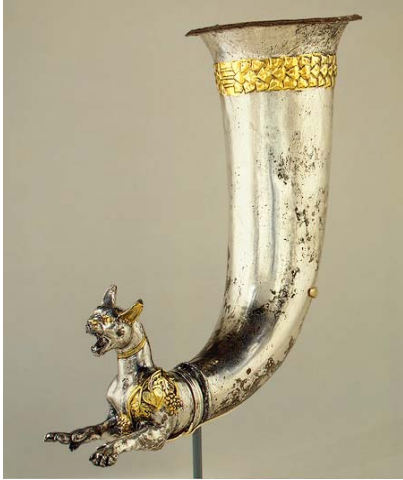
Fig 4. A Rhyton showing caracal (Metropolitan Museum of art in New York), (Ziaie, 1996).