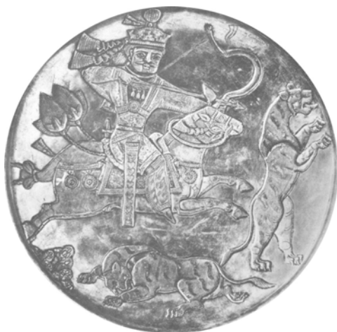
Fig 8. A Silver plate from Daylaman showing Shah killing a tiger