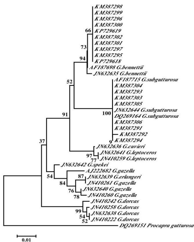
Fig. 2. Neighbor-Joining tree based on the analysis of 410 bp of Cyt-b sequences. The resulting phylogenetic tree shows that Kharg and Kish Islands gazelles are Gazella subgutturosa , while Hengam and Hormoz Islands gazelles are Gazella bennettii .