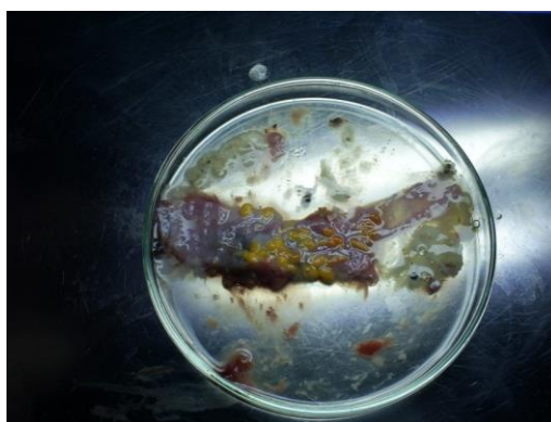
Fig.1. P. laevis Plerocercoids in S.cephalus intestine.