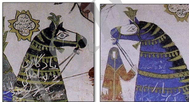
Fig. 5&6. Head drawing of Hazrat-e Ghasem & Hazrat-e Aliakbar's horses. Photo: Minoo Khakpour, 2007.

With a view to the necessity of analysis of the contents and the comparative study of the two wall drawings of the shrine of Pinchah village, it is necessary to mention the specifications of the two wall drawings as follows: In these wall drawings in spite of not using shade, perspective and special lighting depth is only based on