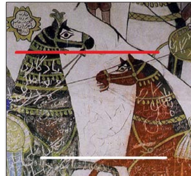
Fig. 11. comparing between horses.

the importance of the individuals of the story. No one of the good and evil creatures enjoy anatomical proportions and exaggeration in drawing and also painting for excitement of religious emotions is common in such a way that the drawer for drawing the holy faces insists on existence of their extraordinary force arising from public belief. The drawer believes that beautiful painting of good personalities and ugly painting of evil personalities and exaggeration in this contradiction creates visual movement and helps in