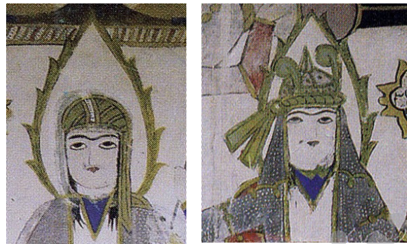
Figs. 3&4. Face drawing of Hazrat-e Ghasem & Hazrat-e Aliakbar with similarity.

saddles and the laces of the horses have been compared and as it is observed the shapes and colors of the two saddles are very similar. (Figs.7 & 8).