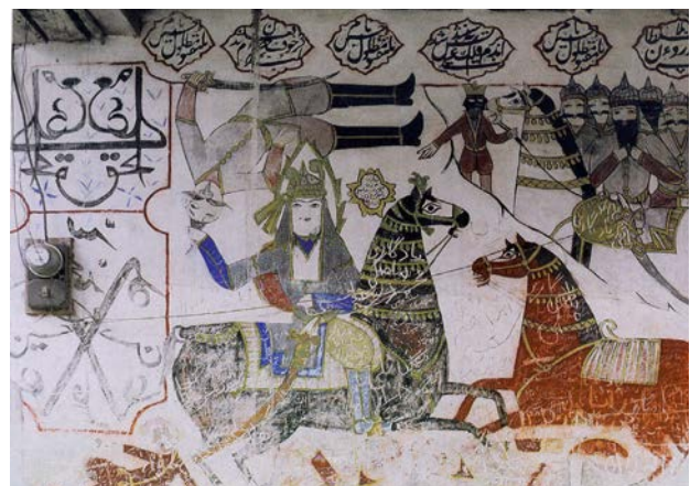
Fig.1. wall drawing of Hazrat-e Ghasem with purpose of war. Photo: Mino Khakpour, 2007.

In the drawings the horses have similar decorations and laces and except in color there is no difference between them. In both images the drawer's seal in on the horseman and the horse's head, which is generally attended by the spectators. (Figs. 5 & 6). In the two following images, the