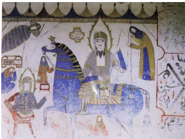
Fig. 2. wall drawing of Hazrat-e Aliakbar with purpose of family.