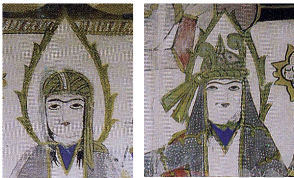
Figs. 3&4. Face drawing of Hazrat-e Ghasem & Hazrat-e Aliakbar with similarity.

saddles and the laces of the horses have been compared and as it is observed the shapes and colors of the two saddles are very similar. (Figs. 7 & 8).