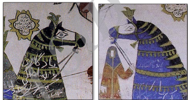
Fig. 5&6. Head drawing of Hazrat-e Ghasem & Hazra-et Aliakbar’s horses.

With a view to the necessity of analysis of the contents and the comparative study of the two wall drawings of the shrine of Pinchah village, it is necessary to mention the specifications of the two wall drawings as follows: In these wall drawings in spite of not using shade, perspective and special lighting depth is only based on