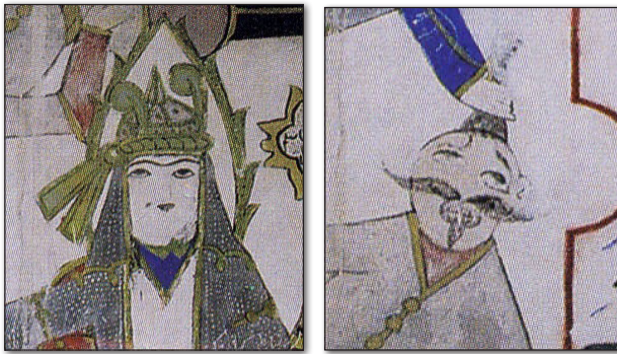
Figs. 9&10. Face drawing of Hazrat-e Ghasem & son of arzagh shami with details.