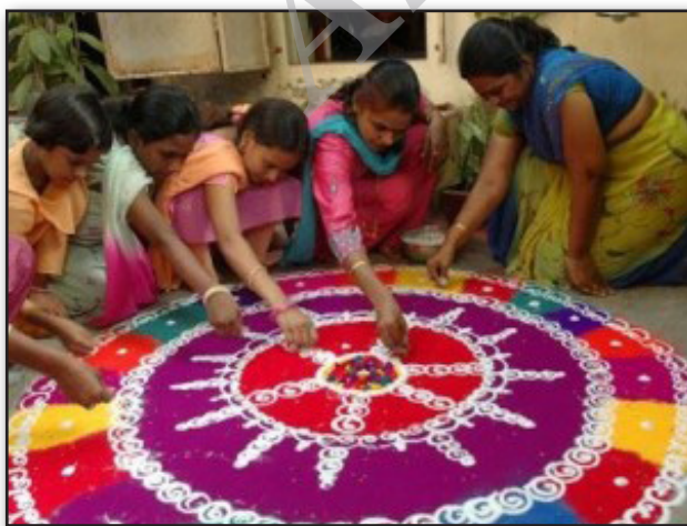
Fig.1. Indian women making Kollams.

Kolam is ornamental earth graffiti, painted by Hindu women of Tamil Nadu 8 in front of the gates of the houses, yards, temples, and the sanctuaries. Although today stone powder and chalk is used in painting them, rice flour was applied on the ground traditionally (Fig.1). The age of these paintings go back to 2500 B.C and Indus civilization. They