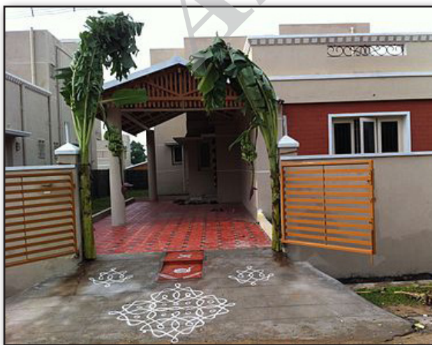
Fig.3.Kollams atthe entries.