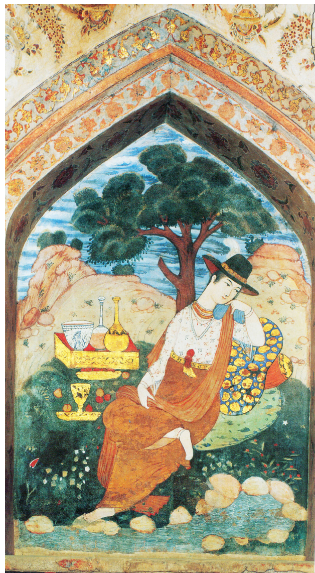
Fig. 1. Fresco, Chehel Sotoun Palace, School of Isfahan.

painters of the Renaissance, which is more manifested in Fig. 3. That is to say that geometrical and triangle frames that are considered different as an aesthetic indicator. In fact, “The aesthetics system of Iranian ancient miniature, which was broken off in the school of” Isfahan” will be replaced by an incomplete naturalism in paintings of Mohammad Zaman. He uses the achievements of the Renaissance artists in an arbitrary and artificial way and therefore his artworks lack accurate principles of perspective, perspective (graphical) of atmosphere, adjusting light and shade and the anatomy. On the other hand,