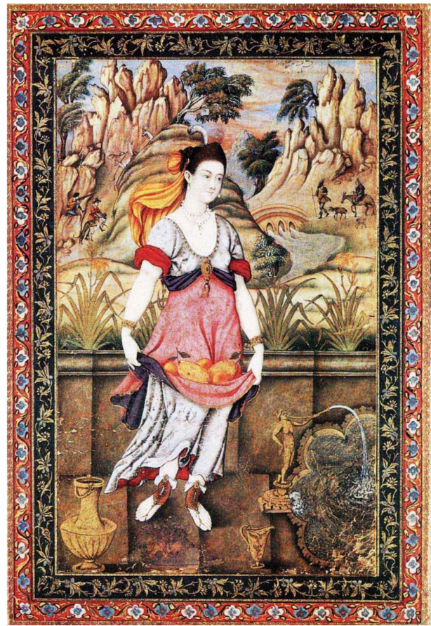
Fig. 3. European women, the artwork of Ali Quli Jubehdar. The late seventeenth century.

According to what has been described, it can be said that cultural relations through social ways and various social factors such as wars and conquering other countries, political and economic relations have an important role in shaping and creating elements of aesthetics and technical structures of Persian miniature in the Safavid era. This process mainly occurs historically and in a developmental way, during which in the confluence of cultures, they accept some elements and reject some of them. So this will lead to the change or generation new cultural texts. In case of the selected example of this paper of the way of forming elements and aesthetic structures of painting and generally the method of foreignization, have been affected by the intercultural confluence of Iranians in the Safavid era and Europeans. And other hand fundamentally the world view and the influence of foreign culture elements in the Safavid era and Western painting techniques and inclination towards monographs like the artworks of Mohammad Zaman in aesthetic representation of the artworks related to this era and their structures have had a main and profound influence on the evolution of artworks. While the main foundations of Persian miniature or painting in most cases remain stable, that this feature is the sign of the strength of intercultural interaction that Iranians have always dealt in the best way with it.