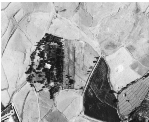
Fig 6. The location of Americans' home garden in an aerial photograph of year 1335.

the order, plot and definition of the axes of motion has changed a lot and its restoration has been done on the basis of the status quo.(Fig 8).