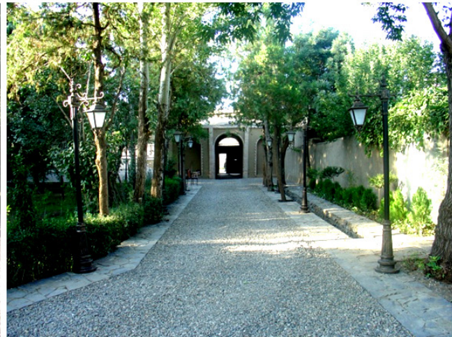
Fig. 4. A view of west elevation and the entrance portal in Nazari garden. Photo: Hatefi Shojae, 2013