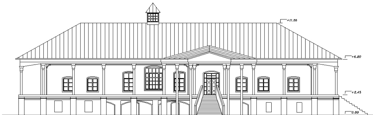
Fig. 2. The western elevation of the Nazari Garden mansion in Hamadan.