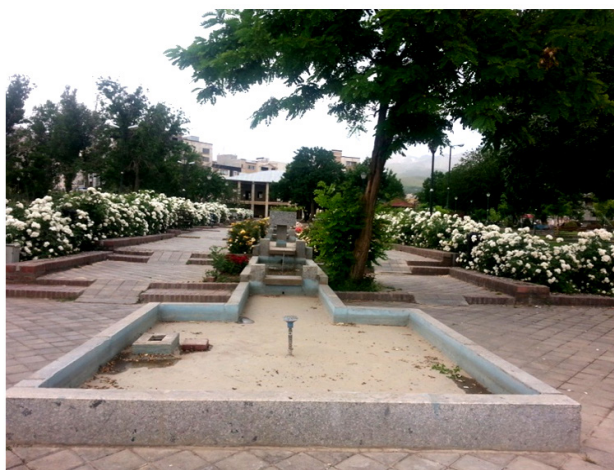
Fig. 7. Water axis front mansion of Americans' home garden.

The pavilion reconstruction is in progress. Results of materials collected by catalogues of garden based on inventorying and documenting are shown in Table 2.