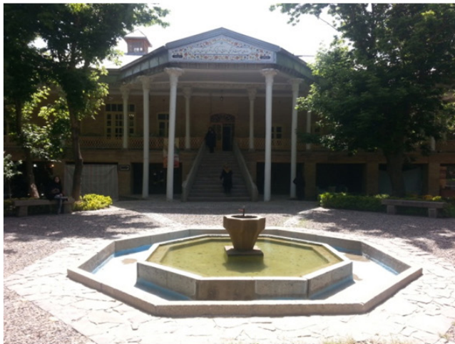
Fig. 3. A view of west elevation and the entrance portal in Nazari garden.