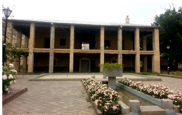
Fig. 8. A mansion South elevation of Americans' home garden. Photo: Hatefi Shojae, 2013