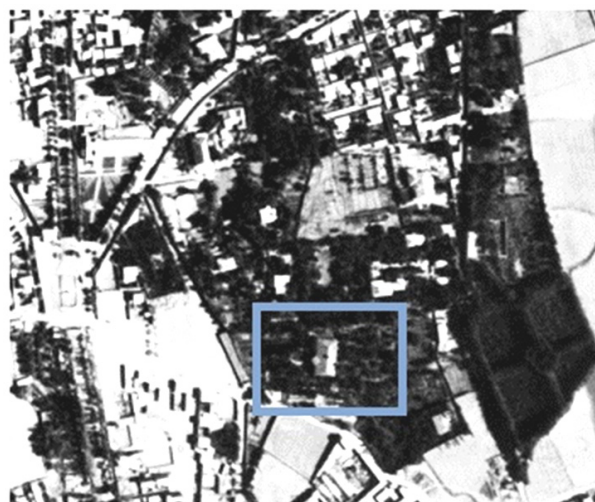
Fig. 1. The location of the Nazari garden in an aerial photograph of year 1956.

In architectural order of garden, pavilion located on the east side of the garden is the most important element, and the building entrance through two axes is associated with the pavilion. In repairing structural elements including the entrance pavilion there are not many changes in the mansion, but some decoration was added during the reconstruction of the mantion. Two main axes, east-west and north-south, pavilion, pond and garden and entrance are the main elements that have been refurbished and restored to their original shape and changes in the