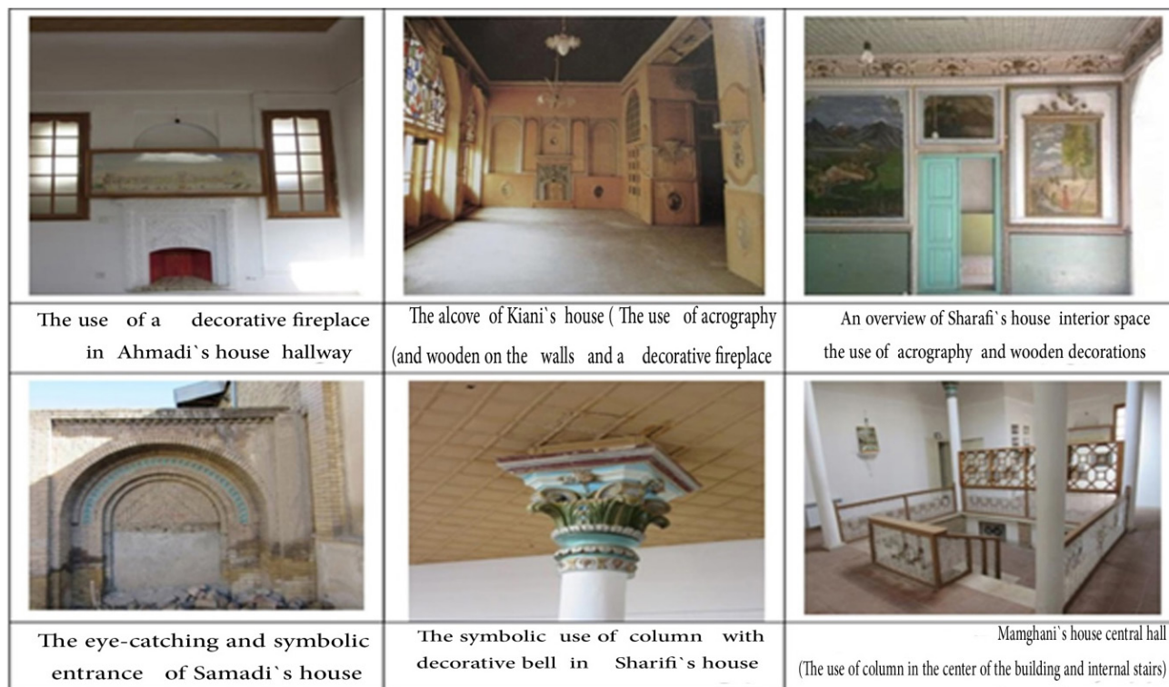
Fig. 2. Developments studied interior design and decorating the house.

the interior spaces, especially in the alcove and the main hall. Picture 2 depicts some decorations of the houses understudy.