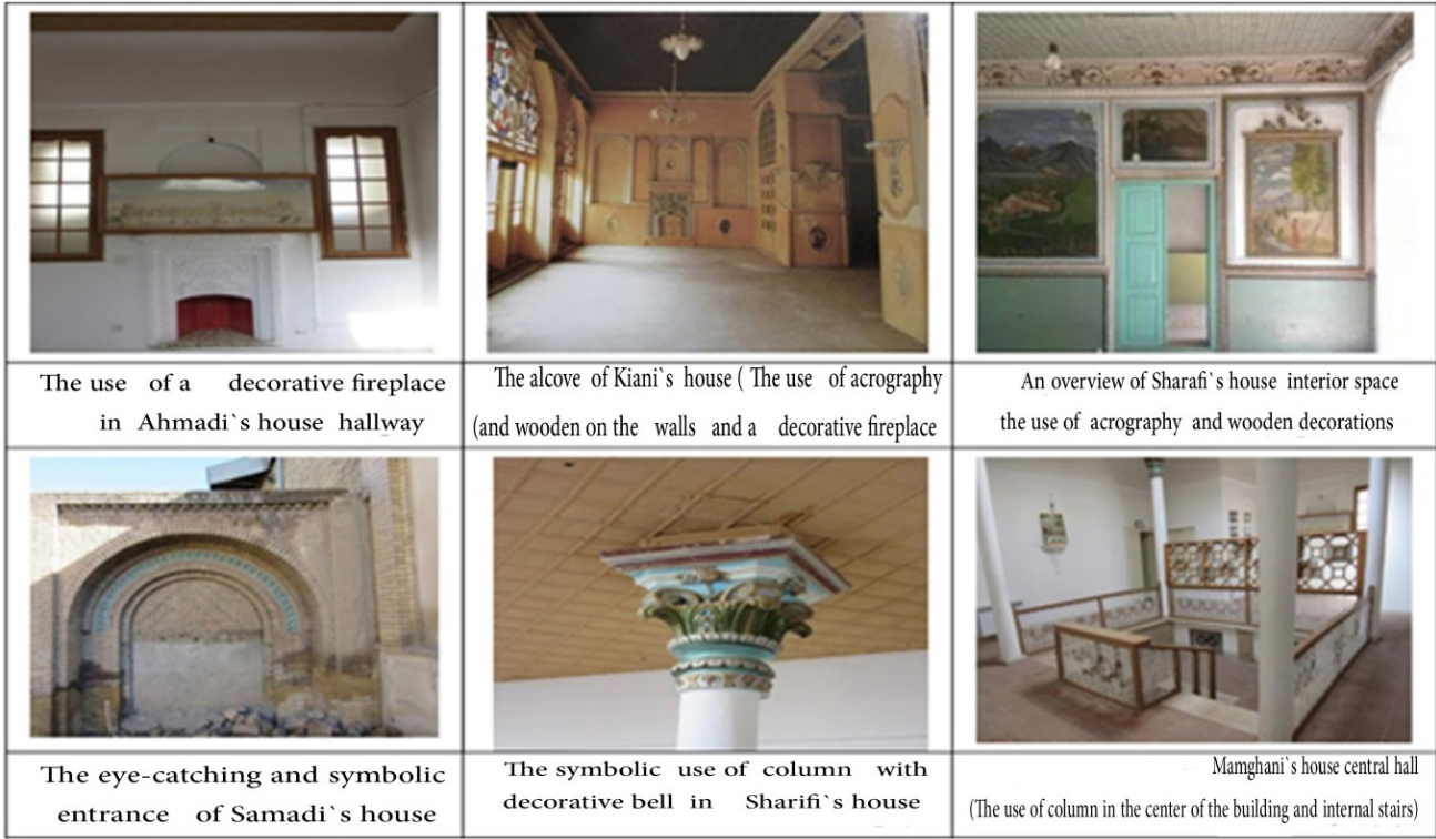
Fig. 2. Developments studied interior design and decorating the house.

the interior spaces, especially in the alcove and the main hall. Picture 2 depicts some decorations of the houses understudy.