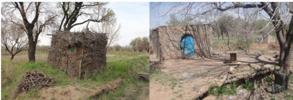
Fig 2. Right: well-house (chāhkhāne) made from brick and some shading trees such as a berry tree for the rest of the gardeners. Left: bower-house (āle) made from branches for the monitoring of the gardens.