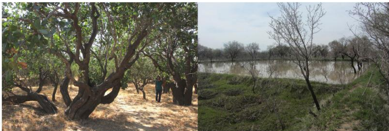
Fig 1. Right: the mixed cultivation of the gardens and the flooding irrigation. Left: the old pistachio trees in the fruit season.

Generally Cultural Landscapes are divided into 3 main categories: landscape designed and created intentionally by man; associative cultural landscapes which shows virtue of the powerful religious, artistic or cultural associations of the natural element rather than material cultural evidence; and the organically evolved landscape which results from an initial social, economic, administrative, and/or religious imperative and has developed its present form by association with and in response to its natural environment. The Qazvin's Gardens can be considered as a subcategory of the organically evolved landscape called "continuing landscape" which retains an active social role in contemporary society closely associated with the traditional way of life, and in which the evolutionary process is still in progress. At the same time, it exhibits significant material evidence of its evolution over time (WHC, 2008: 84).