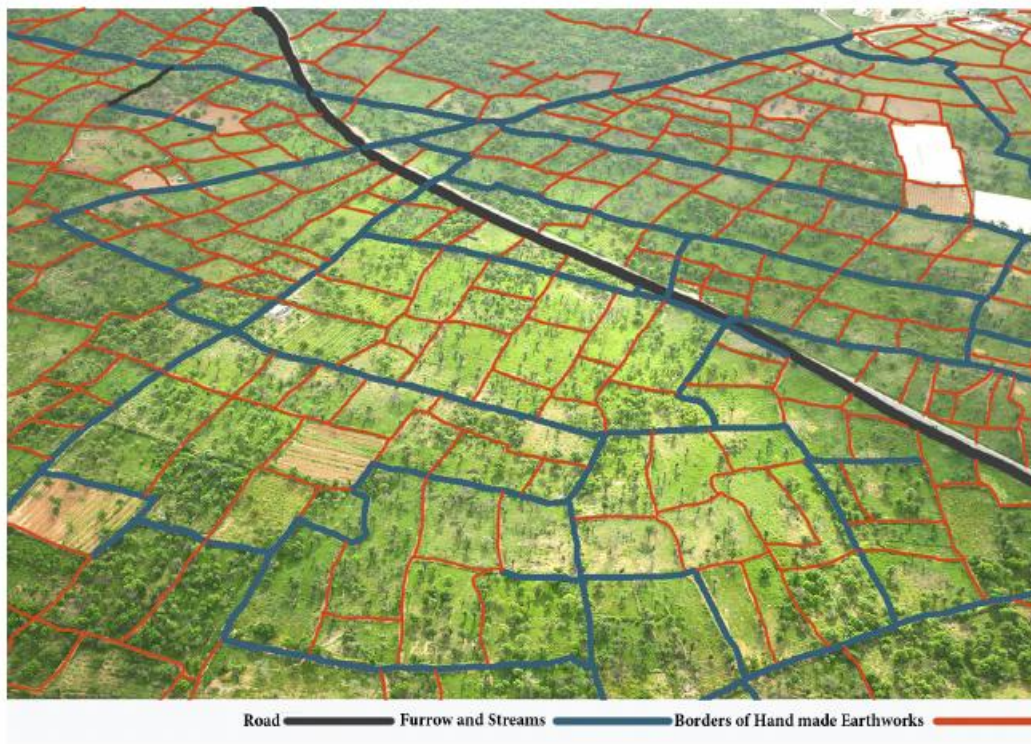
Fig. 4. Land pattern from bird view as organic, non-geometrical network of short earthworks which separate the border of the Gardens.