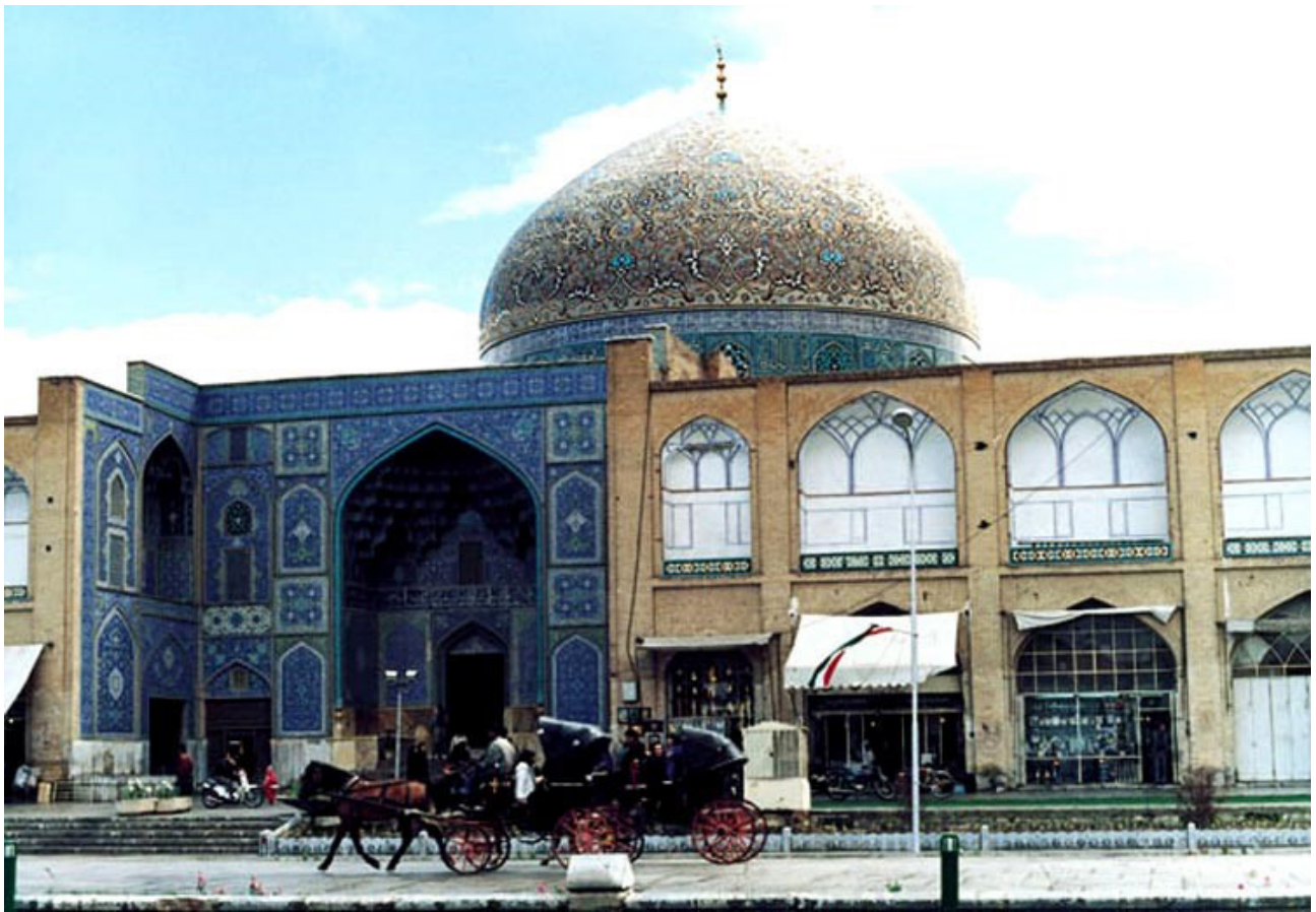
Fig. 1. Sheikh Lotfollah Mosque in Isfahan.