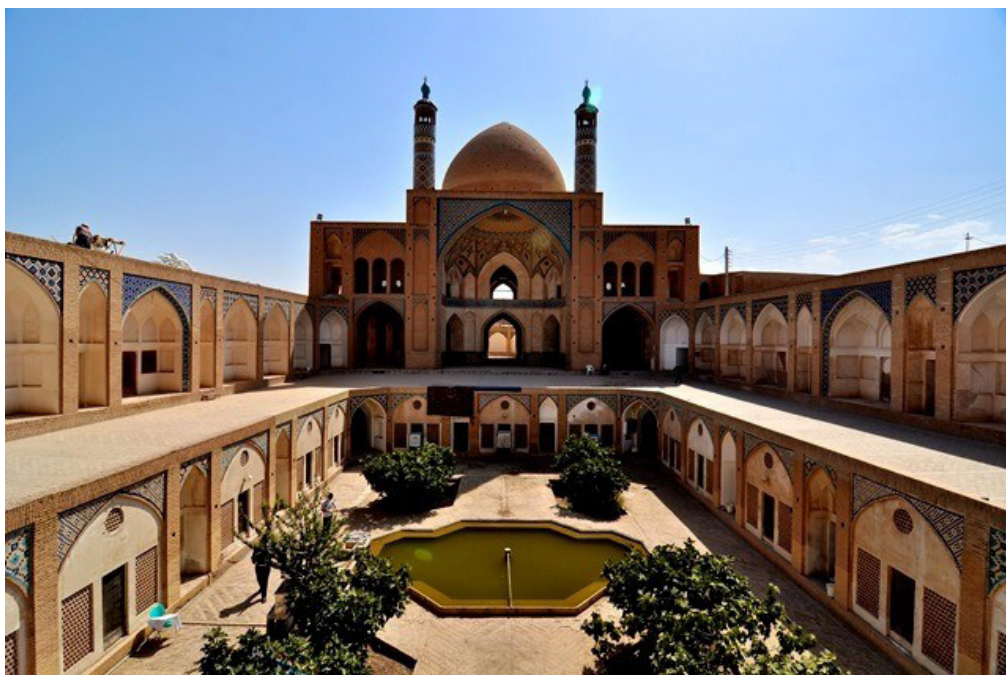
Fig. 2. Agha Bozorg Mosque in Kashan.