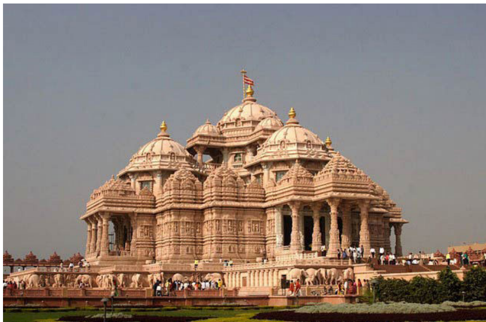
Fig. 4. Akshardham Temple in India.