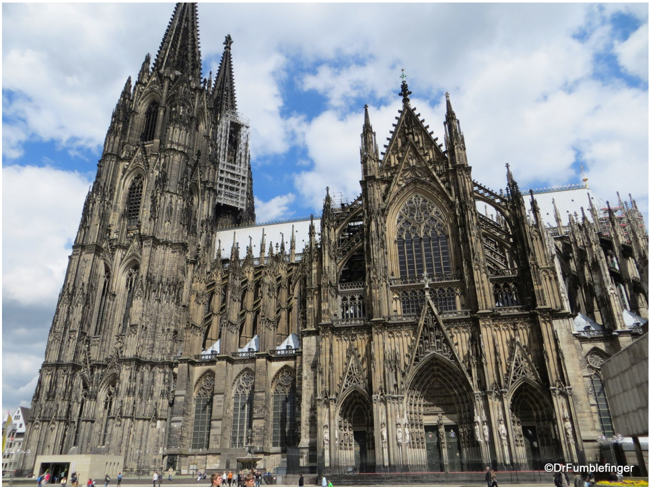
Fig. 3. Cologne Cathedral in Germany.