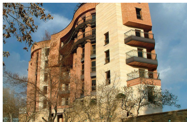
Fig. 6. Residential complex Niavaran street ,Tehran, an example of design disregarding transient fashions.