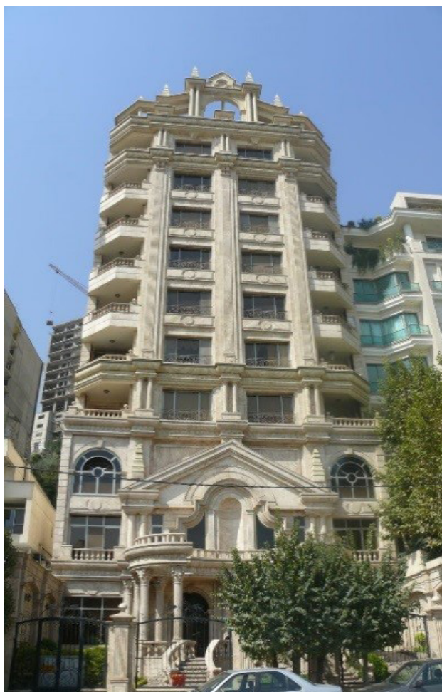
Fig. 5. Residential complex , Niavaran street ,Tehran, An example of so-called classic design.