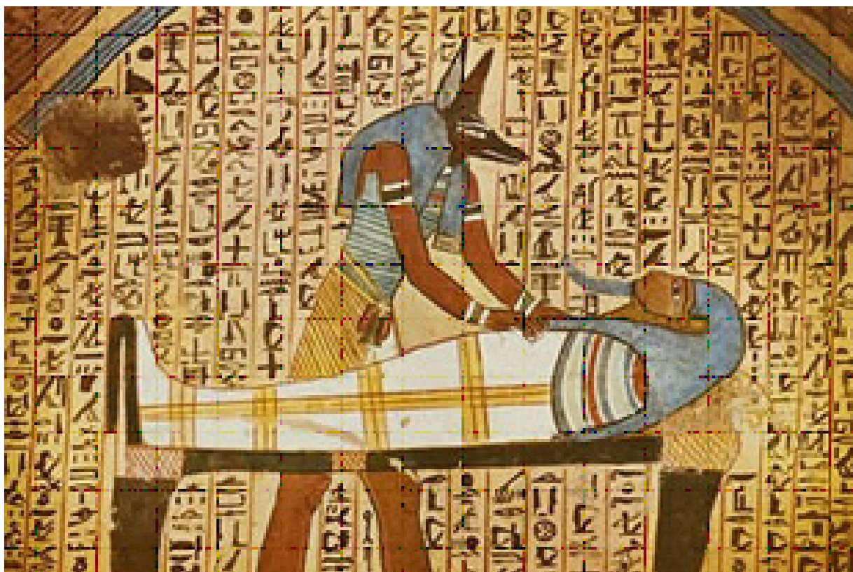
Fig. 4. The mummification ceremony of one of the pharaohs by Anubis.