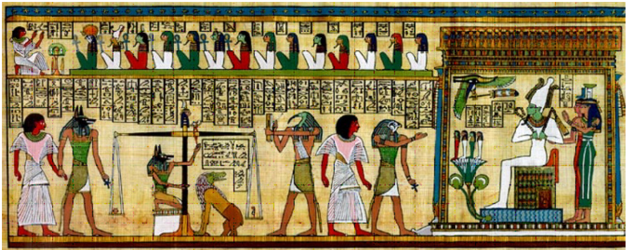
Fig. 2. The Image of the Day of Judgment.

The picture below shows the afterlife and the Day