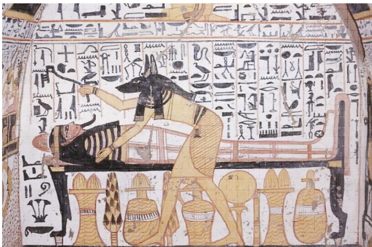
Fig. 5. The mummification ceremony of one of the pharaohs by Anubis.