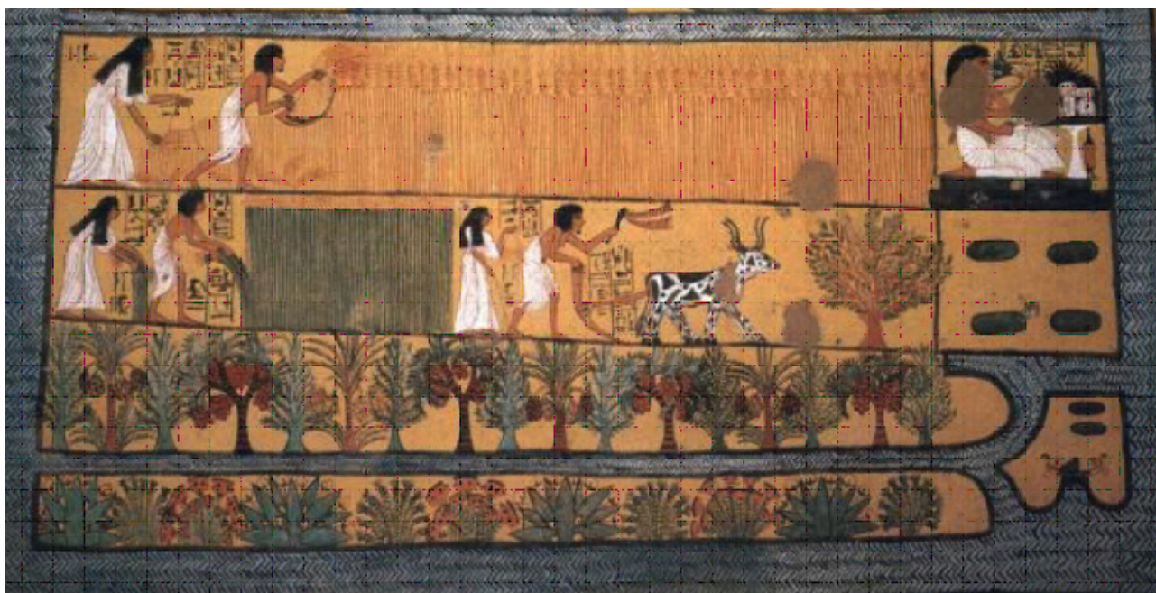
Fig. 1. The Image of a daily life of people.

As can be seen in the following picture, the color of the mummy and Anubis skin, divine beings, are golden,