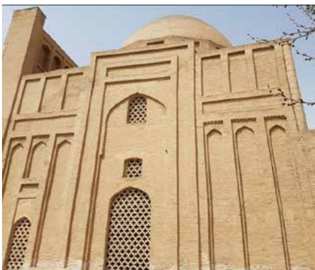
Fig. 6. Arches and Noqul of the Eastern Side. Photo: Hossein Kouhestani.2017.

for artists to decorate it, but this area also left plain and without decoration. Also, the inner chambers of the north side of the building, the altar of the exterior of the north and the presence of four entrances in every four sides of building indicate that the current building is part of a set that could not be built. E'temād-al-Salṭana, who also visited the building during the Qājār period, referred to it as an unfinished construction site, and writes: "In this mansion, the prevailing suspicion is that it was about to be built as the tomb, and its mansion was no completely