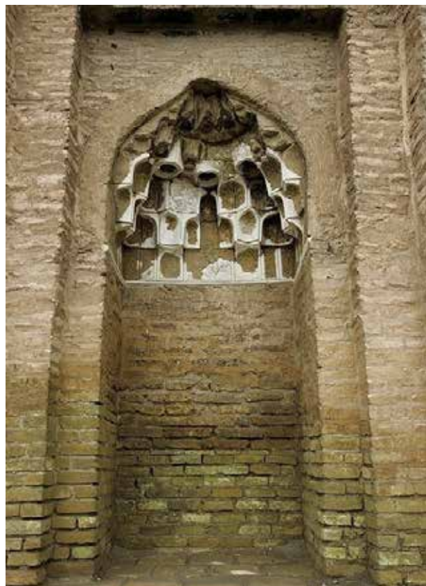
Fig. 8. The outer altar of the northern face of the building.

parts in the past, which now except for the pre-arc entrance, the other three entrances with decorative lattice windows and abnormal brick walls have been restored in recent decades.