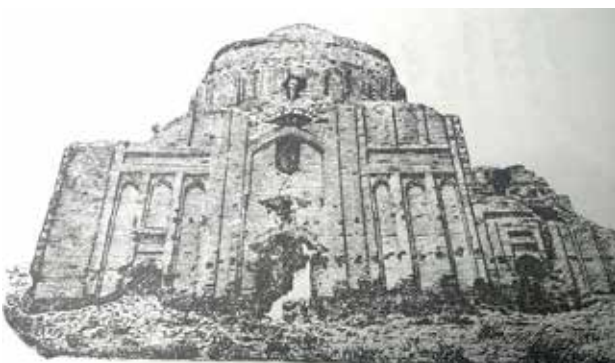
Fig. 3. Oriental view of Haroonia in the QĀJĀR period .

At the same time, Jackson mistakenly called it “the Ferdowsi’s Tomb” in his visit to this monument (Jackson’s 287, 1891: 286)