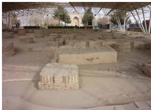
Fig 7. Remains of the mosque adjacent to the Haroonia building. Photo: Hossein Kouhestani.2017.

that the current building is only part of a collection that could be constructed. In addition, archaeological