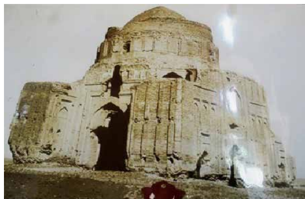
Fig5. Haroonia, East and South Facade.

its final decoration, which was probably a tile. As in the old images of this building, including the images related to the Qājār period, the decorative trim is seen below the front of the entrance to the building (Fig. 5). Of other reasons why the building is unfinished is its simplicity and being free of any decorations in the various drawings, nuggets and frames that are seen on different sides of the building. In addition to the reinforcement aspect, these architectural elements are considered to be the perfect place for decoration, which are abandoned in a simple and uniform manner in Haroonia building. In the same vein, Wilber thinks that the existence of Noqul implying that an external decoration was considered, but never done (Wilber, 1986: 158); (Fig. 6).