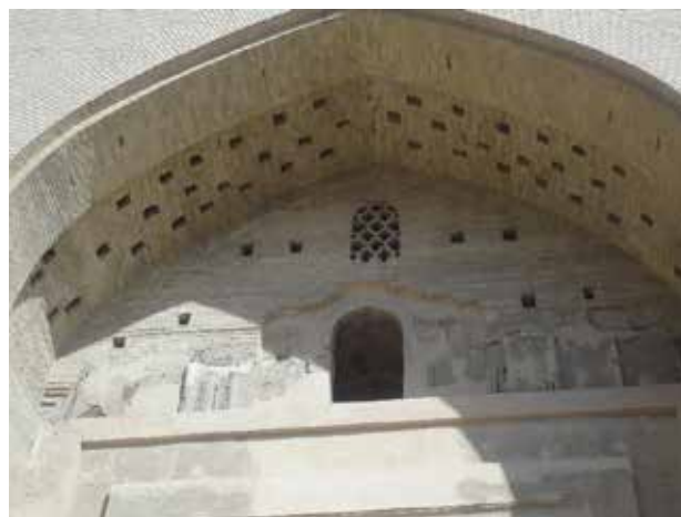
Fig 4. Gypsum coating below the Haroonia entrance door. Photo: Hossein Kouhestani.2017.

There are various reasons why this building remained unfinished. The brickwork of the building with various-sized and uneven bricks shows that this kind of brickwork has never been an indication of completed facet of this magnificent building. On the other hand, the scrutinization of the building reveals that the coating had been made of architectural materials, especially under the anchor or parts that were less exposed to atmosphere (Fig. 4). This suggests that the architect intends to cover the bricks with other materials, the building was prepared for