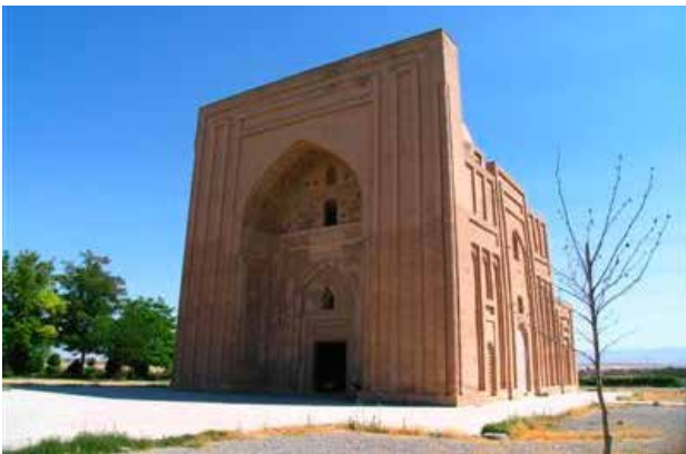
Fig 1. Haroonia, Southern and Eastern View.

In recent decades, research has been done in writing about the architecture of the Harmony building and its functioning and dating from Iranian and non-Iranian scholars. (Fig. 1, Map 1). Among the scholars such as Wilber (1986: 158-157) and Pop (Pop. 1938: 1702.1704), they have elaborated a fuller analysis of the building. Among Iranian researchers, in recent decades, people like Mohammad Mohit