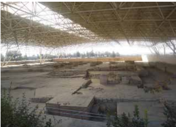
Fig. 2. The mosque discovered in the vicinity of the southern side of the Haroonia Building. Photo: Hossein Kouhestani. 2017.

Edward Nietzsche visited the building between 1893 and 1897, writing: “It’s not clear what the use of this building is” (Yith, 1986: 29). Sykes, who had seen the Haroonia Building in the twentieth century, emphasizes that the building has a variety of names, including dome, grave, palace, and castle, but in a map of the city of Toos, this building is called “The Tomb of Destruction” (Siks, 1963: 42). (Map 2)