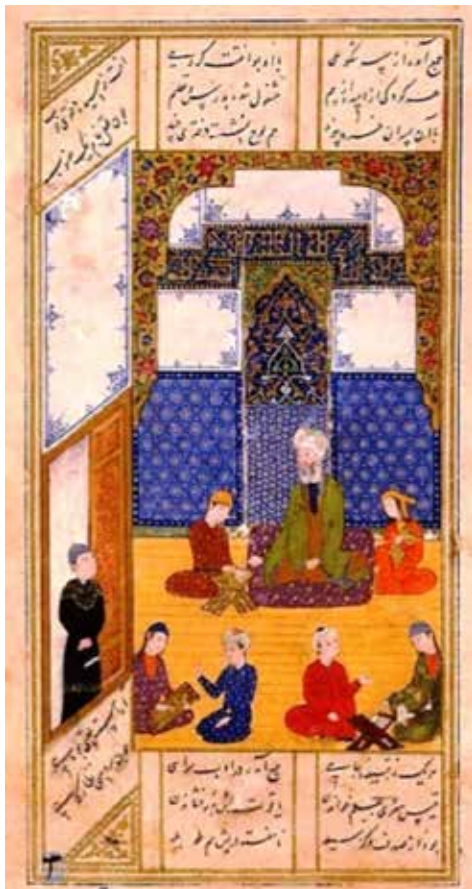
Fig.3. Layla and Majnun at the school of Herat, about 1430 AD