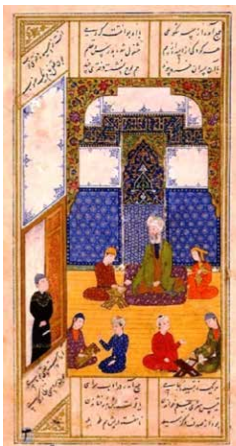
Fig.3. Layla and Majnun at the school of Herat, about 1430 AD.