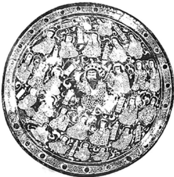
Fig.1. Layla and Majnun at school illustrated on Seljuk pottery, Kashan, late 12th century AD

Iconography analysis: By observing Seljuk pottery and studying related literary sources, it can be understood that this picture refers to Nizami Ganjavi's Masnavi. The love story of Majnun (Qais ibn Maluh ibn Muzahem) and Layla (Bente Sa'd) of the Bani Amer tribe is an example of Arab love story