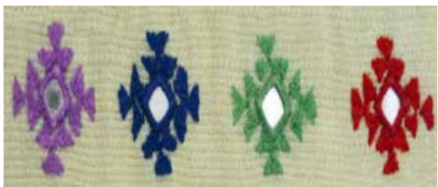
Fig. 7. The Geometric pattern of Bekalouk, Source: Gorgij, 2016.