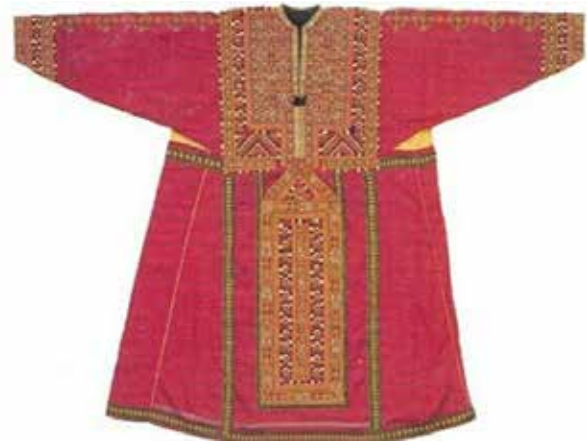
Fig. 8. Balouchi embroidered shirt.

Similar to the studies in Berlin and Kaye, black and white can be distinguished clearly in all the works of the Balouch embroidery. The third color is very important in this art is red, which has been considered as an identity giving color in genuine embroideries. Of course, pure red is used less in old embroideries, and what has been more common is pomegranate red, or Hum. "Green, yellow, blue and brown are, respectively, the other colors, which are used in the next levels for giving importance and meaning to the red color" (Ranjdoost, 2008, 244). But among the colors of the Balouchi needlework, "the orange color is dominant over the rest of the colors, and the details of the design