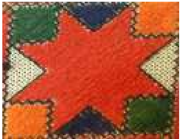
Fig. 5. Flower of Sohr (Red) an example of Balouch floral embroidery motifs, Source: Mobaraki, 2016.