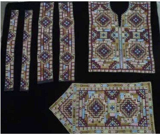
Fig. 1. Ziastin (Balouchi women's clothing embroideries) and its components.