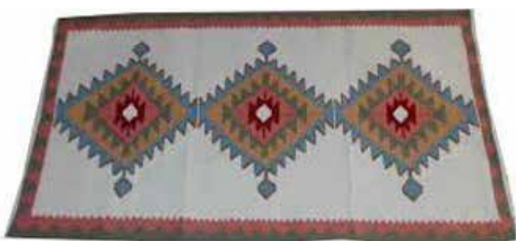
Fig. 11. The pattern of the pond on Kilim of Lorestan nomad tribes, similar to the pattern of the (four-eyed) Charcham in the Balouchi needle work. Source: http://digikalafarsh.ir .