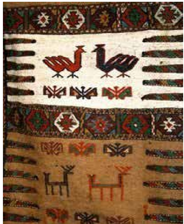
Fig. 12. A sample of Kilim of Kohgiluyeh and Boyer Ahmad nomad tribes is depicted with animal drawings in such a way that no mere abstraction and abstract motive is achieved and the theme of the motifs is recognizable. Similar to such a painting cannot be observed in needle works or other indigenous Balouchi arts.