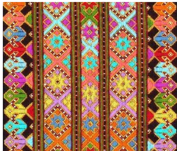
Fig. 9. A Sample of Alternate Rhythm in Balouchi Embroidery.

are more determined by the colors of green, black and brown" (Yavari, Mansouri & Soltani, 2011, 36).