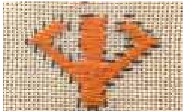
Fig. 4. Floral pattern of Sarvak (small cypress).