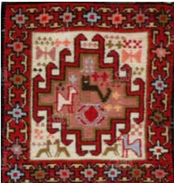
Fig. 10 . A Varnish sample (needle Kilim from Ardebil with geometric patterns and straight lines.

of the line, shape, texture, rhythm, and color were organized on the basis of a more general criterion which is named symbolic abstraction in this art. Among the cultural components affecting this abstraction, it was also referred to the nomadic life background of this tribe that historically seemed to be influenced by the severity and weakness of abstract aesthetics in this art. Livestock breeding lifestyle demands geometric symbolism, which has been endorsed by scholars such as Edwards and Read, and elsewhere in Iran some cases of this have been referred to. Symbolic abstraction with exaggerated geometric and abstract features occurred proportionately to the historical background of livestock breeding of this tribe. Thus, the research hypothesis which emphasized the importance of abstraction in the symbolization of Balouchi needle working patterns as its most significant aesthetics aspect, was confirmed based on the research findings. The special aesthetical feature of this art in abstraction and highly abstract and unique symbolization can be introduced as a kind of identity document for the embroidery of this tribe.