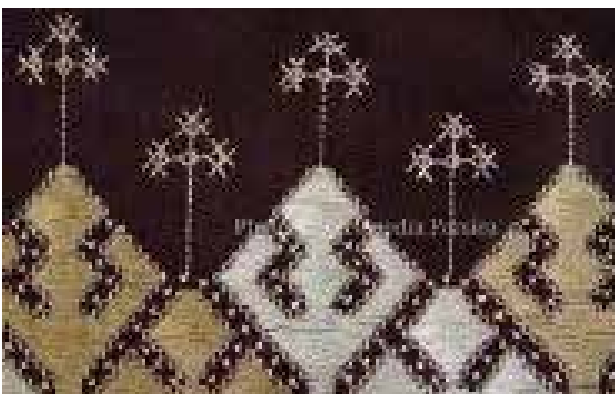
Fig. 3. The pattern of hen (chicken) punj (paw), is similar to chicken paw.