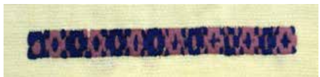
Fig. 6. Time (Season) of proximity.