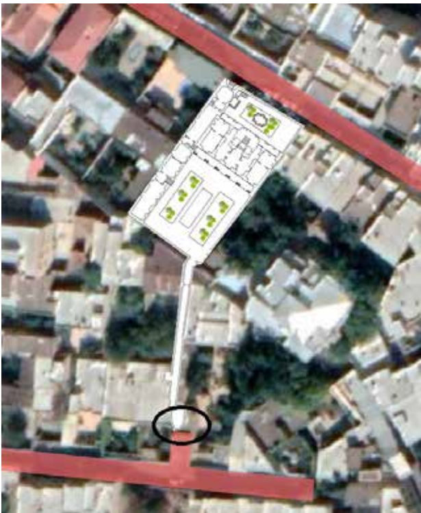
Fig. 1. Plan of Sharbat-Oqli House and the location of the façade as the case study in this article.