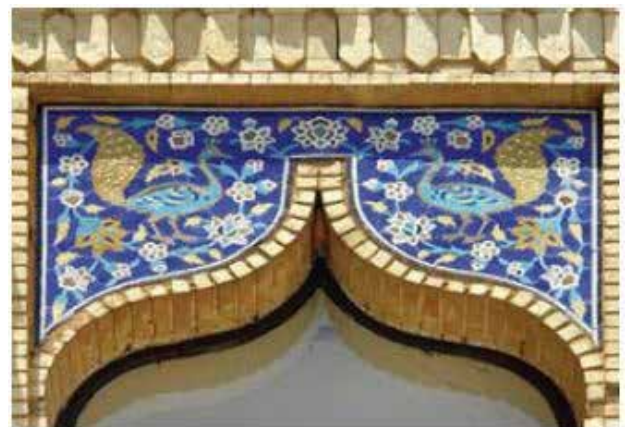
Fig. 9. The motif of two peacocks and tree of life, in a part of the façade of Artists House of Isfahan, which was built at late Qajar period as a house. Photo: Somayeh Jalali-ye Milani, 2016.