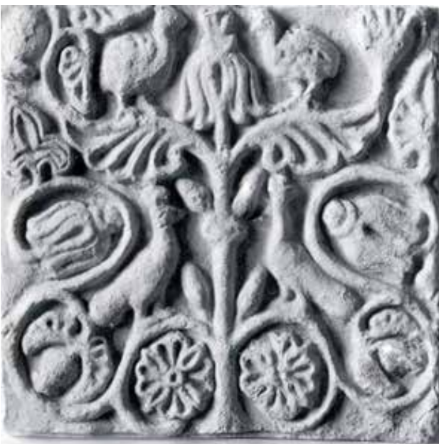
Fig.6.The motif of tree of life and peacocks on the Ctesiphon relief, Sassanid Era, Metropolitan Museum.

and Arabs have taken it to far East (Pourkhaleghi Chatroodi, 2002, 96), In the culture of ancient Persia, snake (dragon) was known as a symbol of the devil which sought to dominate the tree of life, an occurrence that could lead to disasters such a drought. Accordingly, in images involving the tree of life, some guardians are appointed to protect the tree and its fruits, which are usually animals such as mountain