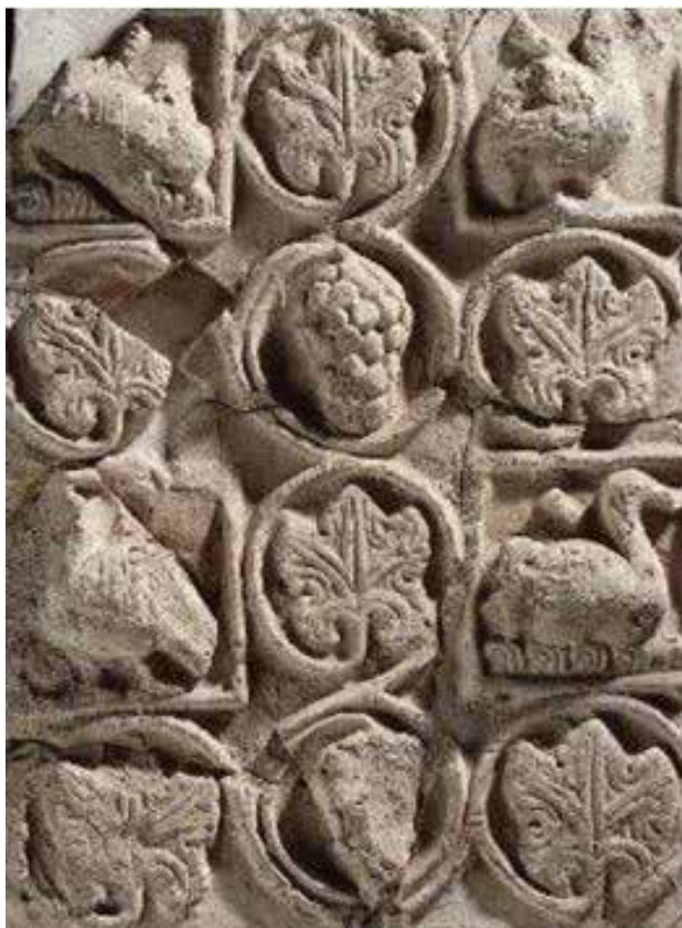
Fig. 10.A molding with the pattern of a bird on grapevine in Chaltarkhan, Source: Mobini & Shafei, 2016, 56.

1. Using an iconological approach in studies about the facades of historic houses provides the researcher an opportunity to get knowledge about conscious or unconscious thoughts, existing in architect's, builder's, owner's or every other involved person's mind, that has had an impact on façade design and construction process. It is obvious that these thoughts have been influenced themselves by architectural