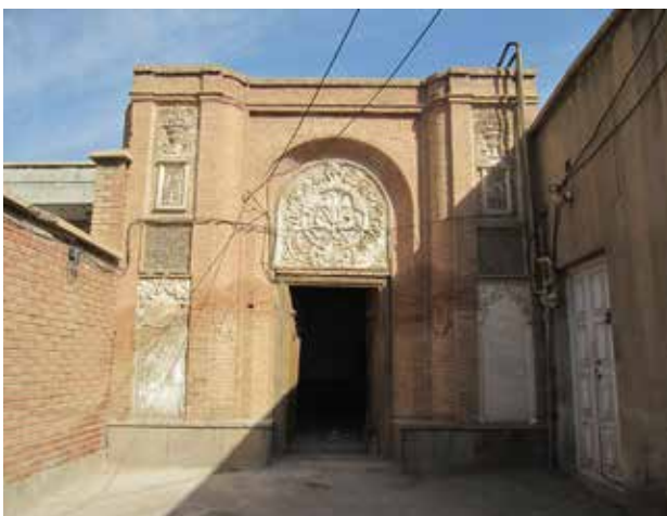
Fig. 2. The façade facing toward north passage. Photo: Somayeh Jalali-e Milani, 2016.

criteria for designing a favorable façade such as excitement, diversity, identifiability, memorability, vitality, identity, imaginability, readability, flexibility, simplicity, clarity, the domination of a part of the form, adaptability with the environment, meaningfulness and informativeness. Hence, relying on the knowledge obtained from studying such topics- which shape the practical experience, a history of architecture researcher can have an iconographical