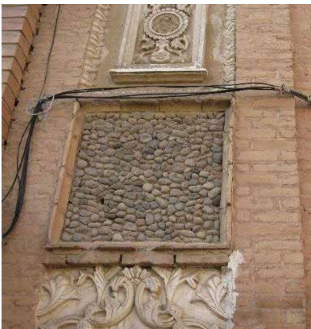
Fig.4. The gravels used on both sides of the façade of Sharbat-Oqli House in Tabriz.

Chand neshini ke khâje key be dar âyad [At the door of the hardhearted masters of the world How long would you sit hoping the master come at the door]