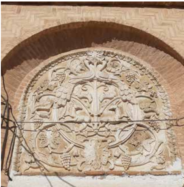
Fig.5.Plaster molding on the Portal of Sharbat-Oqli House in Tabriz. Photo: Somayeh Jalali-ye Milani, 2016.