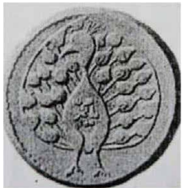
Fig. 8. Gold coins related to the Qajar period.