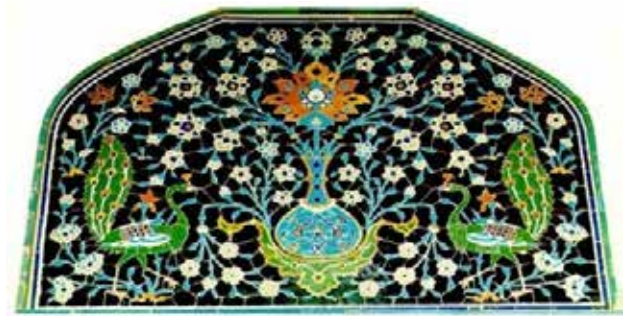
Fig.7. The motif of Two peacocks and tree of life, Portal of Imam Mosque in Isfahan, Safavid period.

Obviously, the iconological interpretation of the molding on the façade of Sharbat-Oqli House is