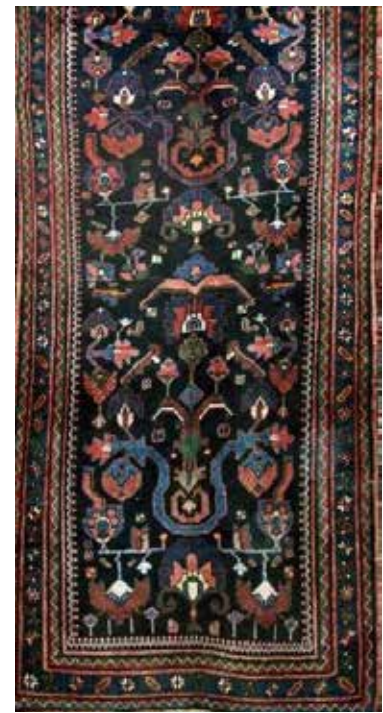
Fig. 18 (left). Carpet with Vase plan (woven in Chozeh).