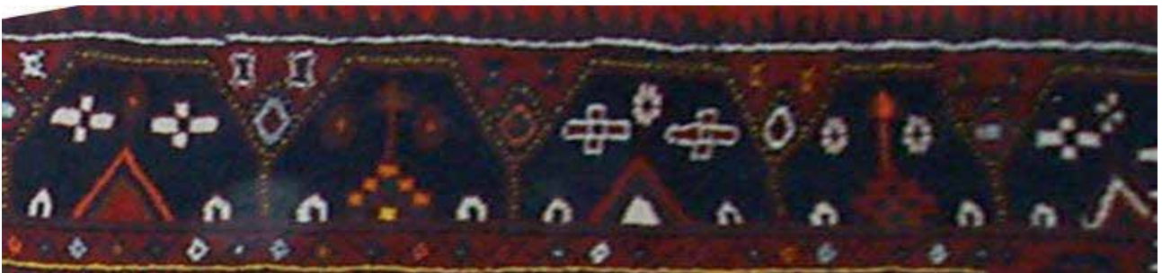
Fig. 27. Church border in Armenian carpet, a part of Fig. 6, Kharaghan.