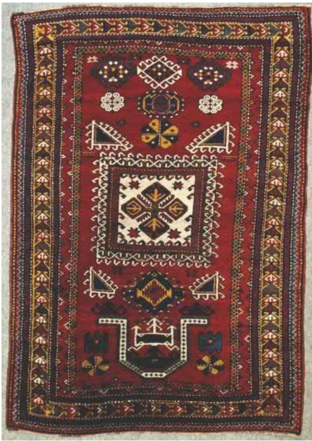
Fig. 17. A carpet woven in Panbak with vase plan.

form in Armenian carpets; moreover, it was used as a single pattern on Armenian clothes. Considering all that, Astakh, along with the patterns of church and cross are among the important features of Armenian carpets.