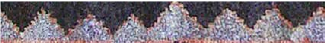
Fig. 45. Ghondo border (woven in the village of Lar).