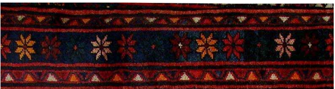
Fig. 29. A cross with the repetition of the sides, a part of Fig. 15.