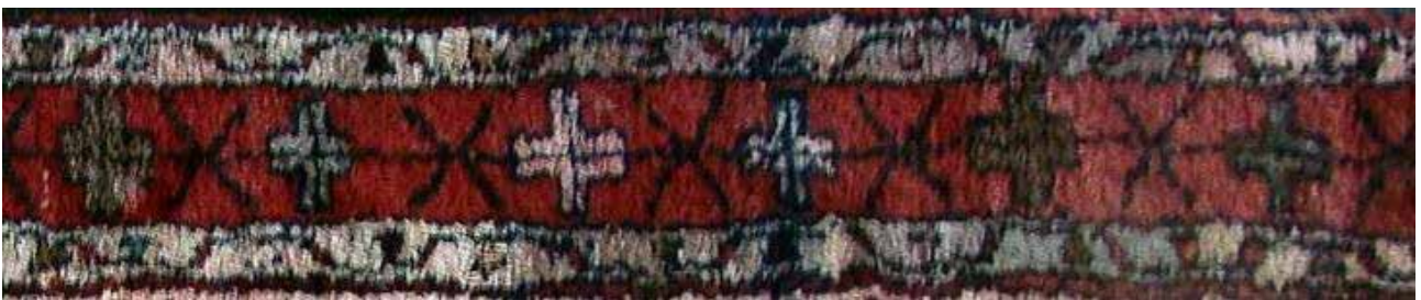
Fig. 28. The cross border in Armenian carpet.