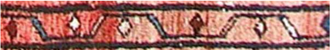
Fig. 43. Blujik border (woven in the village of Lar).