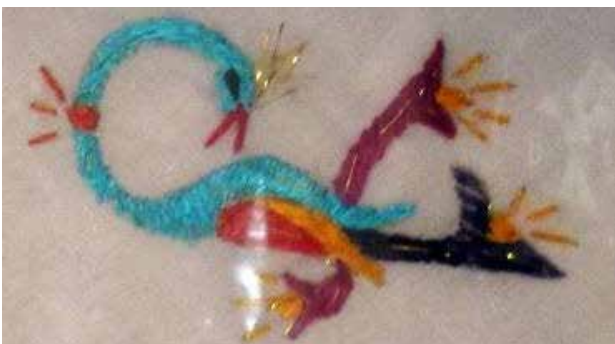
Fig. 41. The pattern of a hoopoe on decorative Armenian fabric, Virgin Mary's church, Tehran.

in the Armenian word Տէր (ter) which means Allah (Karapetian, 2012).