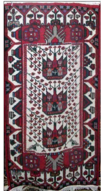
Fig. 5 (left). Armenian carpet with Plate and bowl (cherry) plan (woven in village of Chonaghchi).