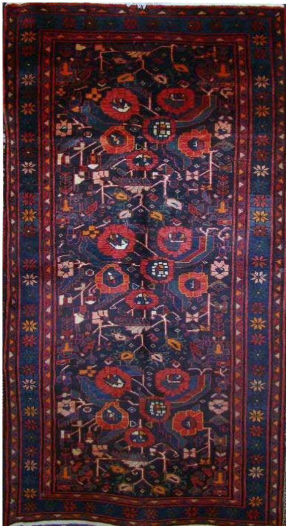
Fig. 8. Armenian carpet with a Scattered sunflower plan (woven in the village of Chonaghchi).