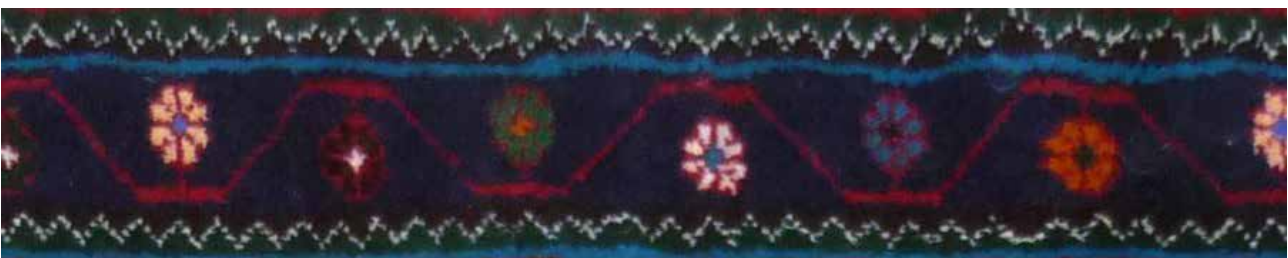
Fig. 36. Blujik border (woven in the village of Lar).