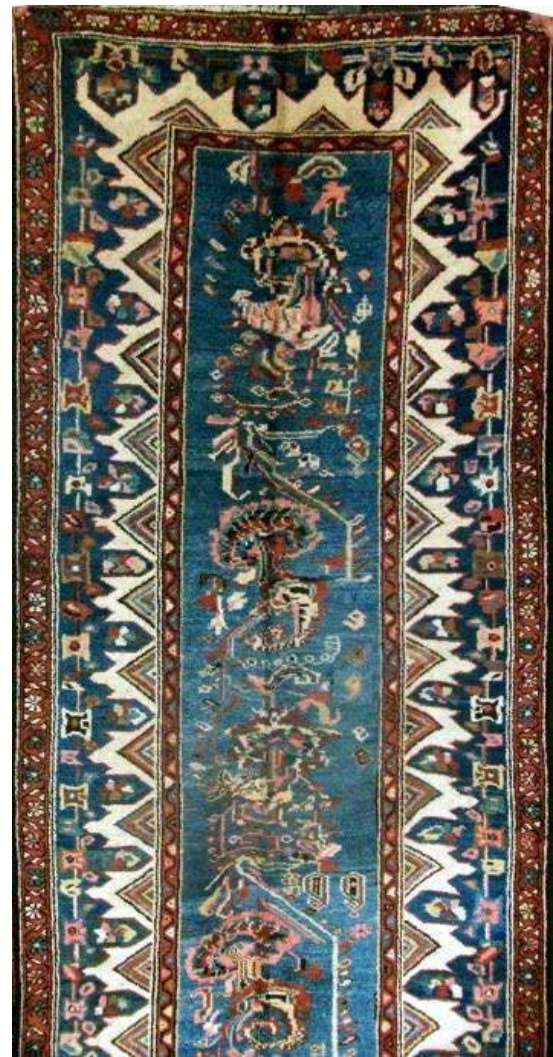
Fig. 9. Armenian carpet with Scattered flower plan (woven in the village of Choze), from Mahdi Kabiri's collection.

seen in other Armenian arts as well (Fig. 24). This border is a feature of Armenian carpets so that they can be distinguished from similar plans of other tribes. Since one type of it is used in the carpets of Chonaghchi (Chanakhchi), it is also known with this name (Fig. 25).