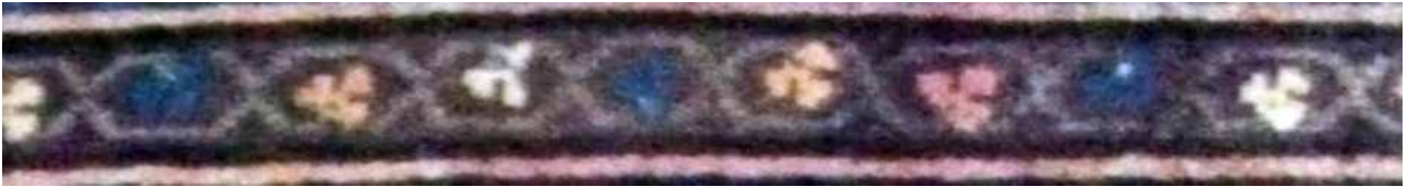
Fig. 44. Symmetrical Blujik border (woven in the village of Alachan).