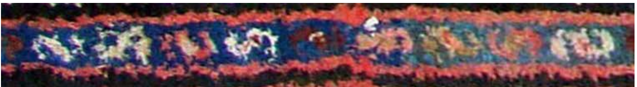
Fig. 46. "S" border.