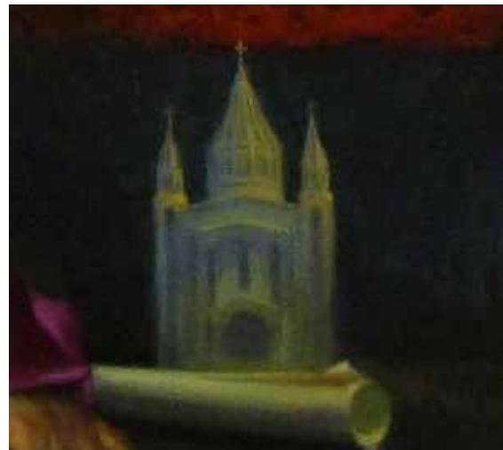
Fig. 24. The pattern of a church in Armenian painting, Virgin Mary's Church, Tehran.

border is not specifically for Armenian woven carpets although it is known by the name of Blujik among Armenians (Figs. 42, 43 & 44).