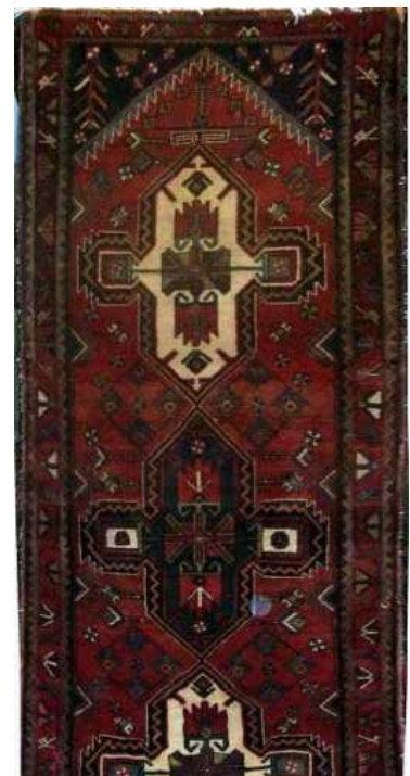
Fig. 13 (left top). The pattern of a four and eight-leaf flower in carpets with Armenian plan in Kharaghan. Source: Authors’ archive. Fig. 14 (left bottom). The pattern of an Astakh (star) in carpets with Armenian plan in Kharaghan. Source: Authors’ archive. Fig. 15 (middle). A carpet was woven in Tou Abad, with Cross medallion plan. Source: Authors’ archive. Fig. 16 (right). A carpet was woven in Tou Abad, with Cross medallion plan. Source: Authors’ archive.