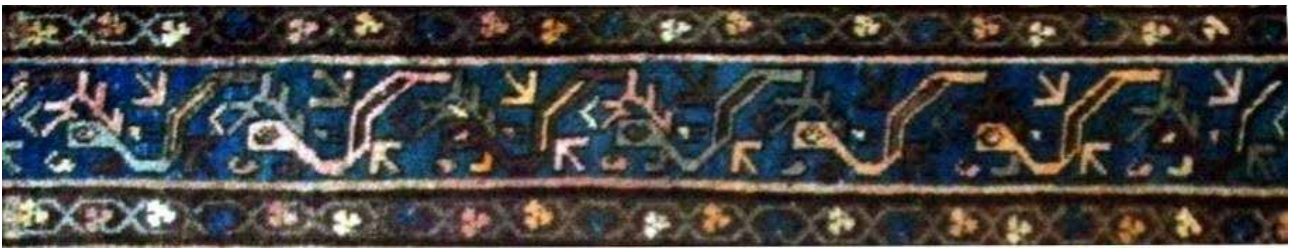
Fig. 38. Hoopoe border (woven in the village of Alachan).