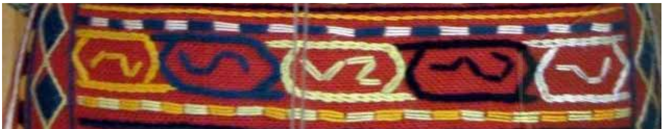
Fig. 47. Armenian women's wear with a decorative S stripe.