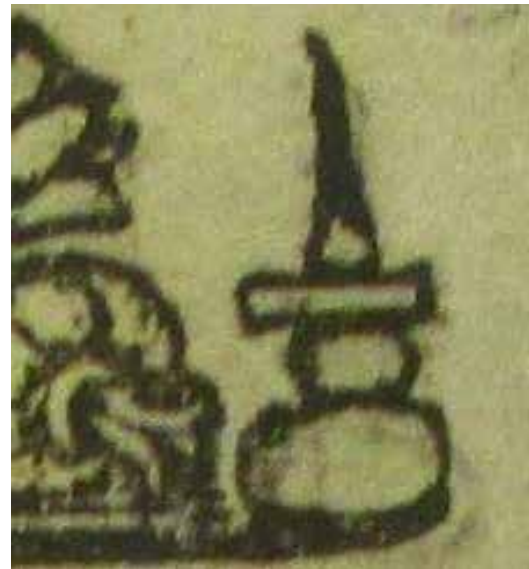
Fig. 4. The pattern of a light in a tablet of the Bible.