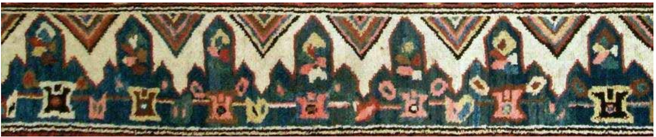
Fig. 25. Church border (Chanakhchi) in Armenian carpet, a part of Fig. 8.