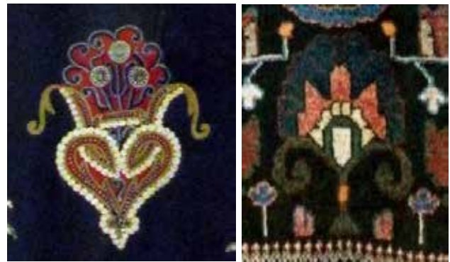
Fig. 22 (left). The pattern of a vase on Armenian decorative fabric, Virgin Mary Church, Tehran. Source: Authors' archive. Fig. 23 (right). The pattern of a vase in Armenian carpet, a part of Fig. 18. Source: Authors' archive.

- Blujik border: This is mostly used along with large hoopoe border. A type of this border is the one that is used in carpets from Tarom and Shahsavan plans by the name of Apple flower or Beautiful Flower. This