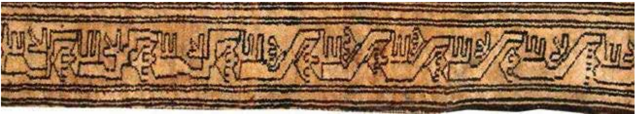
Fig. 39. Hoopoe border (woven in the village of Abgarm).