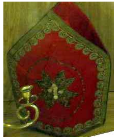
Fig (left). 33. Annunciation Star on an Armenian dish, Virgin Mary's Church, Tehran.