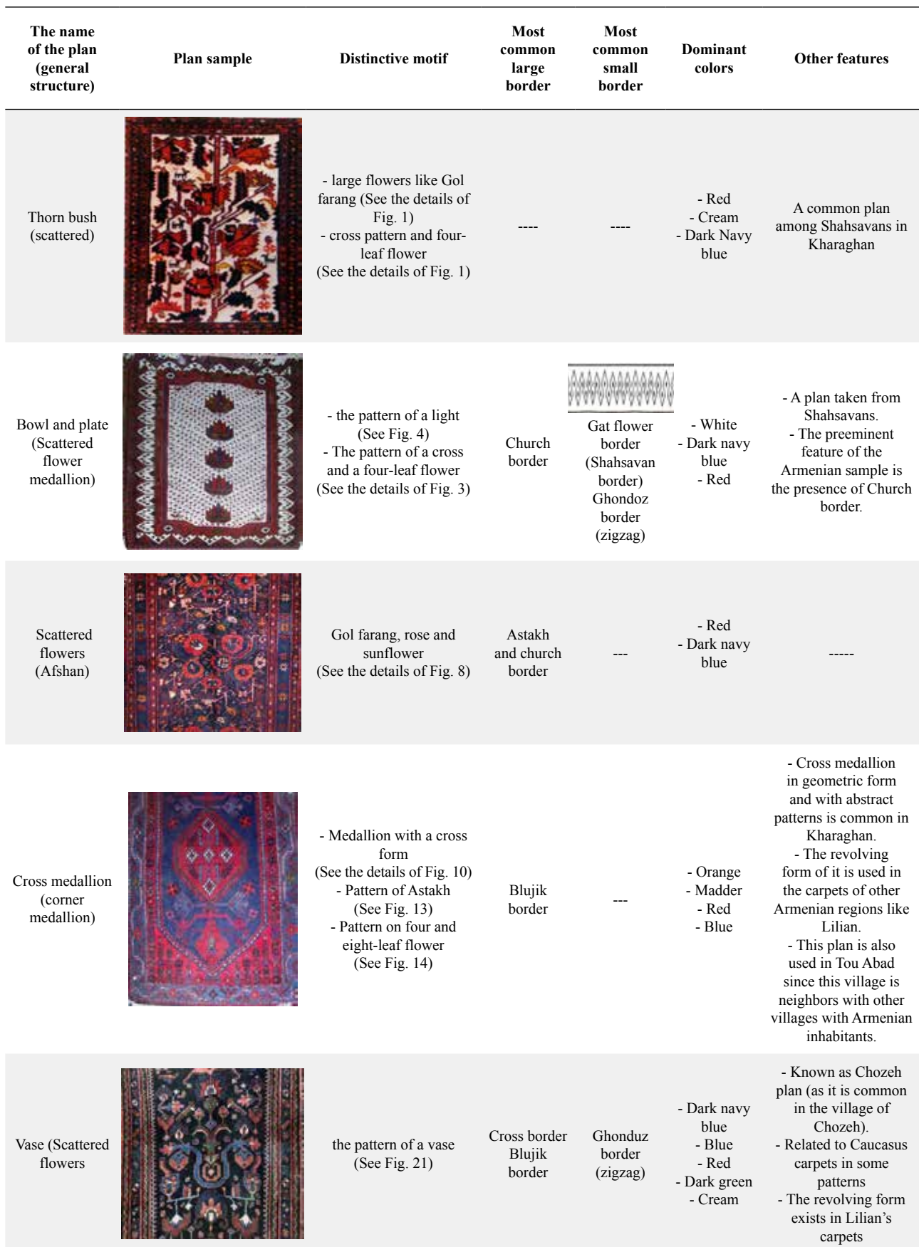
Table 1. The general features of carpets with Armenian plan in Kharaghan.