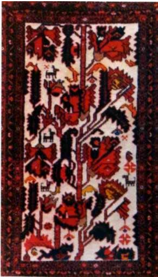
Fig. 1. Armenian carpet with thorn bush plan (woven in Lar).