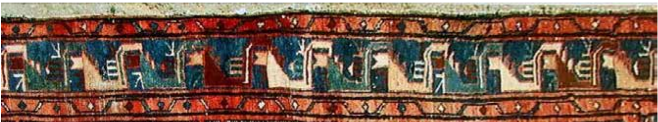
Fig. 40. Hoopoe border (woven in the village of Lar).