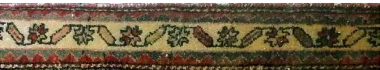
Fig. 37. Blujik border, a part of Fig. 18 (woven in the village of Chozeh).