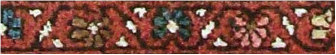
Fig. 42. Blujik border (woven by in Kharaghan).