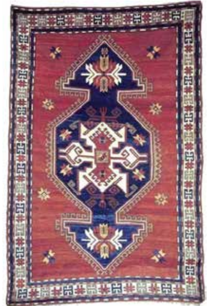
Fig. 10 (left). The Cross medallion plan (woven in Kharaghan). Fig. 11 (middle). The Cross medallion plan (woven in Panbak). Fig. 12 (right). The Cross medallion plan (woven in Panbak).