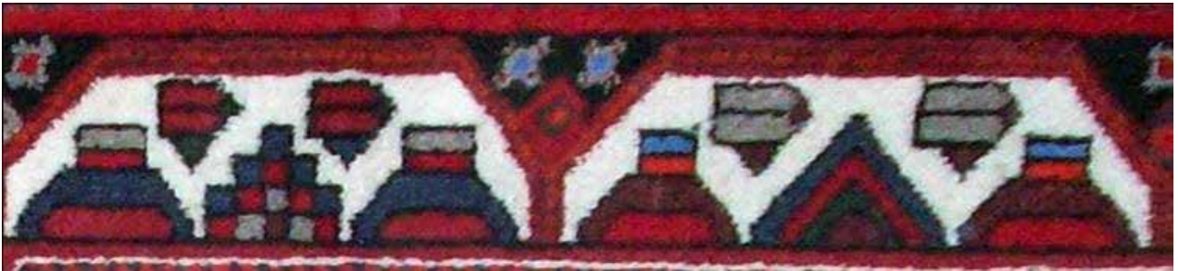
Fig. 26. Yort border in Shahsavan carpet, Kharaghan.