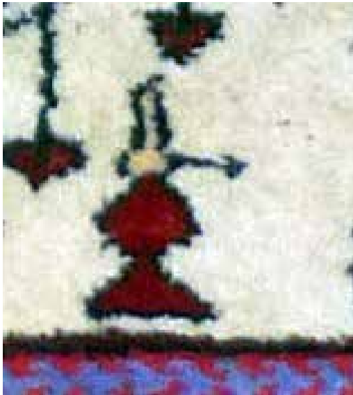
Fig. 3. The pattern of a light in Armenian plan, a part of Fig. 5.

- Church border: As it is clear from its name, it is inspired by the shape of a church and it can be