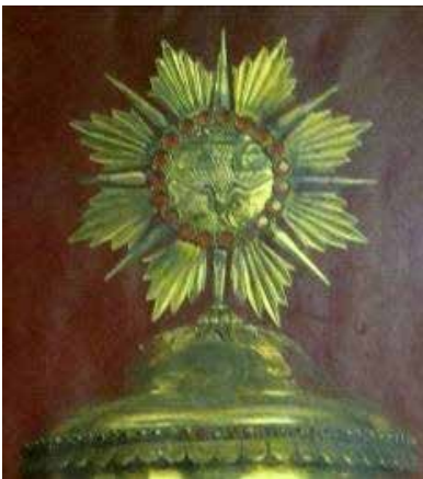
Fig. 32 (right). The Star Gospel, an Armenian woman's shoe, Virgin Mary's Church, Tehran.