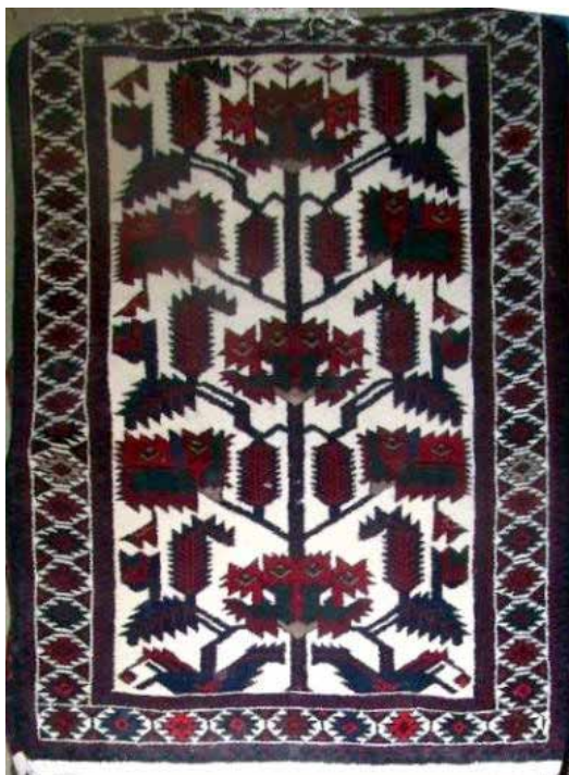
Fig. 2. Carpet with Armenian plan, thorn bush plan (woven by Shahsavans in Kharaghan).

in the body of this plan is the use of large flowers with other small designs (Figs. 8 & 9). Sunflower and Gol farang have the highest frequency. Figure 8 shows an Armenian carpet with a Scattered flower and Sunflower design. In the body of this carpet the steps of the growth of a sunflower to the time it is withered is shown. Large Gol farang motifs are used in other Armenian fabrics and paintings as well.