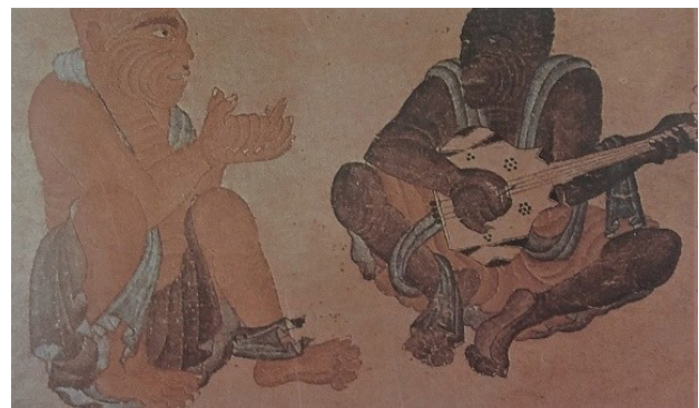
Fig. 4. Muhammad Siyah Qalam, Herat. Source: Grabar, 2011, 149.