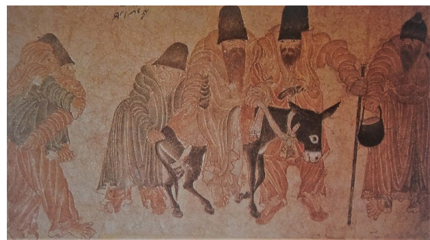
Fig. 6. Muhammad Siyah Qalam, Herat.

miniaturists were required to follow specific rules for drawing figures, rules which remained unchanged throughout different periods (Fig. 7). It was only after Western art rose in popularity that those traditional rules faded away and realism emerged over time. In conclusion, Siyah Qalam’s figures are exaggerated and bear no resemblance to those found in Persian miniature. - Repetition: Line and color are two visual elements essential to Persian miniature, where things are depicted using solid colors and outlines. The use of