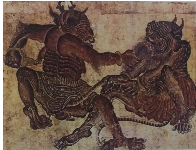
Fig. 1. Muhammad Siyah Qalam, Herat.

report of their journey reads: "The team arrived in the city of Qumul [Hami] on August 22, 1419. There, Emir Fakhr al-Din had built a grand mosque, near which the heathens [Buddhists] had a temple. All around that temple, they had erected small and big idols in a novel fashion, and over the temple door was an image