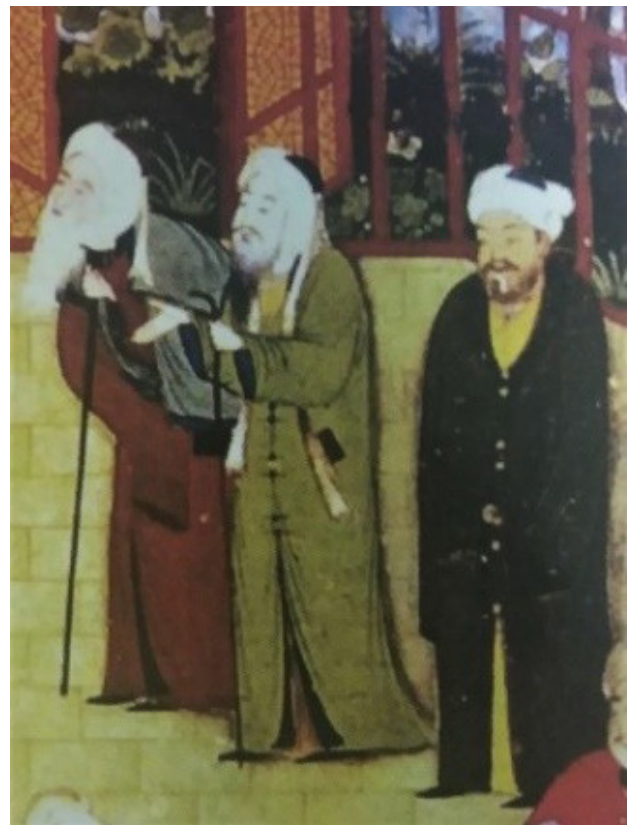
Fig. 7. (Detail) Kamal ud-Din Behzad, Herat. Source: Azhand, 2013, 314.