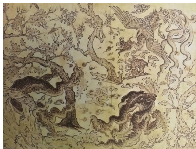
Fig. 5. Muhammad Siyah Qalam, Herat.