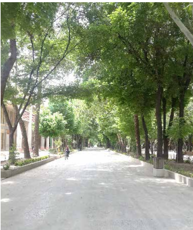
Fig. 5. A photo of Chahar Bagh Street when the temporary retail shops are absent. Photo: Mina Kashani Hamedani, 2019.