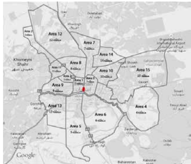
Fig. 1. The location of Chahar Bagh Street in Isfahan City .

As it was mentioned before, the interviews were conducted with three groups of people in Chahar Bagh Street: 1. Fixed shopkeepers, 2. Passersby and users and, 3. Urban experts and managers. The data collected via the interviews were coded and thematically analyzed. The coding was performed at two levels. Then, the codes were conceptualized, followed by the determination of the links between them and their agglomeration in a new manner, which led to the formation of 33 axial codes. In the final stage, seven categories (selective codes) were determined about the relationships between temporary retail shops and their impact on environmental quality by using the opinions of a number of urban experts and professors, including social interactions, activity congruity, microscale economic mobility, multilayered perceptions, balanced visual composition, environmental suitability and targeted control. The mentioned concepts and qualities include both positive and negative effects of the presence of retail shops in walkways, which have been written under one rubric. Table 1 shows the concepts and qualities formed via the coding process.