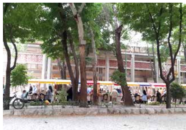
Fig. 3. A photo of the temporary retail shops (booths) in Chahar Bagh Street. The buildings in the background belong to Hasht Behesht Complex which is currently inactive. Photo: Mina Kashani Hamedani, 2019.