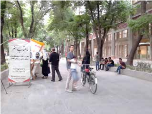
Fig. 4. A photo of Chahar Bagh Street during the business hours of the temporary retail shops.