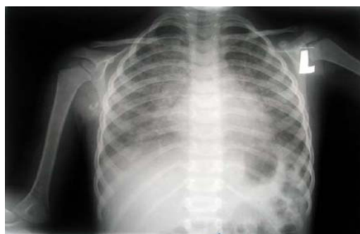
Figure 3. Plain chest film of tuberculous brain abscess of a child with cystic fibrosis

In the present case Ghon complex is seen as a scar of an old TB (Figure 3). Lumbar puncture is a clue in diagnosis of central nervous system infections but it is associated with a 12% danger of unfavorable outcome such as cereberal herniation when a mass lesion is present (10).