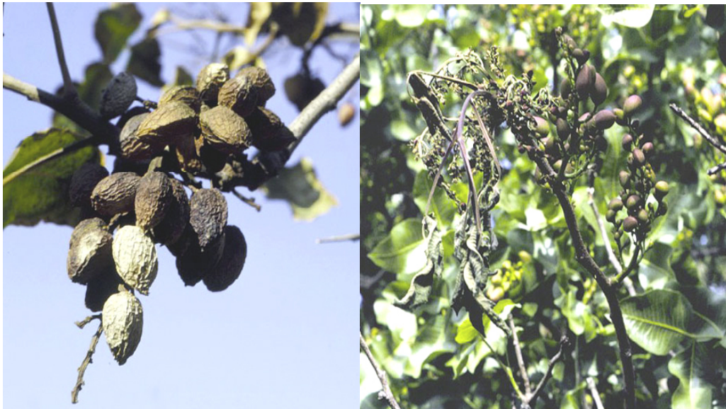
Figure 2: Wilting of pistachio branch and fruits because of root rot of tree by soil borne fungi in gardens.

and amendments were analyzed as a control measure against soil born fungi and nematodes and resulted in about 12°C increase in the soil temperature in other places (15). This increase in soil temperature caused a reduction of about 70 to 80% in the fungal population and about 99% in nematode population at various depths.