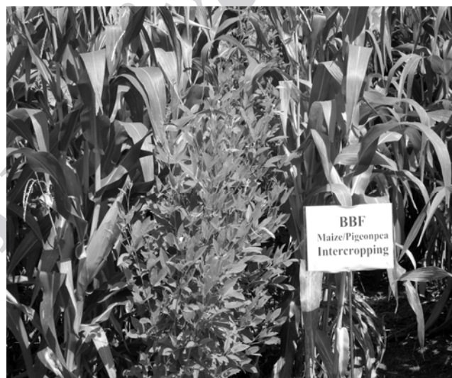
Plate 2. Maize-pigeonpea intercropping on broad-bed and furrow (BBF) system.

maize was also greater in BBF than FOG. In 2003-04, though maize population in soybean/maize intercropping was similar to the sole maize, maize yield was reduced in intercropping by 203 and 244 kg ha -1 in BBF and FOG, respectively. For other years, maize yield in soybean/maize intercropping was lower than the sole maize because of reduced plant population, almost half of the sole maize population. In maize/pigeonpea intercropping, maize population was similar to the sole maize, as pigeonpea was intercropped with maize in the additive series (Plate 2). This trend was observed in every year since 2004-05. Better crop growth in terms of leaf area index (LAI) was observed in BBF. LAI of maize reached its maximum at 2.68 in soybean/maize intercropping under BBF and 2.55 in the same intercropping under FOG (Figure 3); LAI of maize was greater in soybean/maize than maize/pigeonpea intercropping and sole maize, probably because of the less inter-plant competition across and within crop rows of maize. Again, pigeonpea, due to its slow growth in the early stages, did not compete with the fast growing maize. Thus, LAI of maize in maize/pigeonpea intercropping was also greater than sole maize. The growth of maize in soybean/maize intercropping was better than other treatments, because in this treatment maize was sown with 4:1 (soybean: maize) row ratios and experienced least competition.