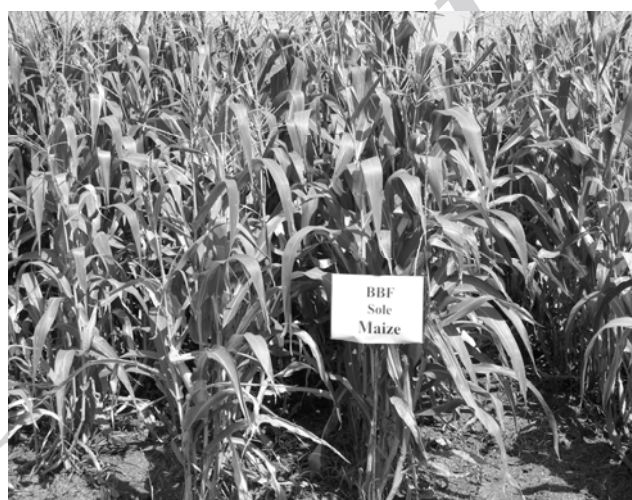
Plate 3. Maize crop under maize-chickpea cropping system on broad-bed and furrow (BBF) system.

* During the year 2003-04, there was pigeonpea sole crop in place of maize/pigeonpea intercropping.