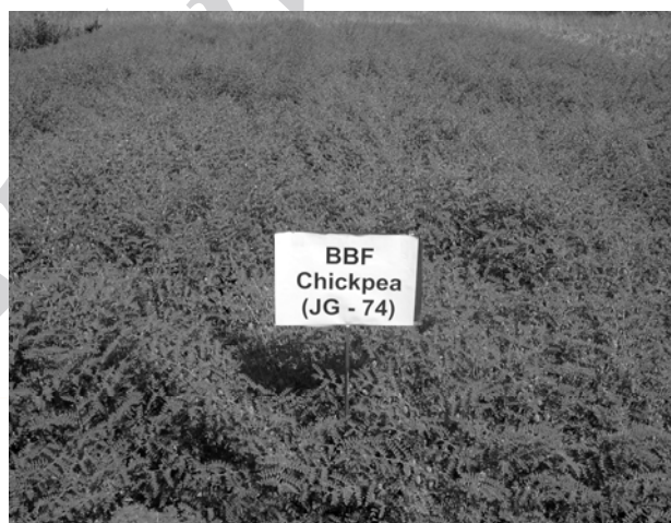
Plate 4. Chickpea crop grown under maize-chickpea cropping system with two irrigations on broad-bed and furrow (BBF) system.