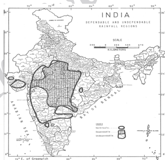
Figure 1. Map of India showing distribution of vertisols soil with dependable and undependable rainfall.

In India, vertisol soils occupy a total area of 70.3 million ha, constituting 22% of the total geographical area of the country, of which 34.3 and 30.2% are in Maharashtra (western India) and Madhya Pradesh (central India), respectively. Other Indian states having significant areas under this soil are Andhra Pradesh (13.4%), Karnataka (8.0%), Gujarat (7.0%), Tamil Nadu (4.0%), Rajasthan (1.5%) and Uttar Pradesh (1.6%). These soils occur in the locations lying between 8° 45' and 26° 0' N latitude and 66° 0' and 83° 41' E longitude (Murthy et al., 1982). Based on annual rainfall and probability of their occurrence, Vertisol region is sub-divided into two categories-vertisols of dependable rainfall areas and vertisols of undependable rainfall areas (Figure 1, Virmani et al., 1988). The areas under the former category are characterized by a reliability of rainfall occurrence at short intervals and average annual rainfall exceeds 750 mm and is located in the flood plains, valley bottom and plateau; whereas the vertisols of undependable rainfall areas receive annual rainfall of 500-750 mm and are characterized by erratic onset, distribution and withdrawal of rainfall. Moreover, frequency of occurrence of dry spells in these low rainfall areas is very high and a large proportion of the annual rainfall is received in the months of September and October only; these areas are primarily located in the rain shadow region in the states of Maharashtra and Karnataka.