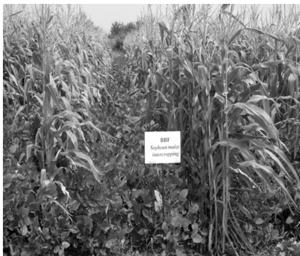
Plate 1. Soybean-maize intercropping on broad-bed and furrow (BBF) system.