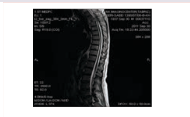
Figure 2. spinal cord MRI

the lower limbs was intact with ability to localization. Suspecting neuropathies, EMG-NCV was performed reporting peripheral sensory-motor polyneuropathy mainly demyelinating types with differential diagnosis of acute inflammatory demyelinating polyneuropathy (AIDP) and critical illness polyneuropathy (CIP). Neurology consultation was performed and after review of EMG-NCV reports they consider Guillain-Barre Polyneuropathy; however, they found a sensory level at T9-T10. It should be emphasized that due to this sensory level and after consulting with neurologist, thoracolumbosacral MRI was considered because spinal cord ischemia was at top of the list of differential diagnoses. Thoracolumbosacral MRI showed the pathologic fracture of the third thoracic vertebra with a compression in spinal cord (Figures 2 & 3). After diagnosis was made, an urgent consultation was performed with the neurosurgery service and the emergency spinal surgery was performed. The pathology of vertebral fracture was an extradural mass; the definite site was unknown and metastatic adenocarcinoma was probable. In the follow-up period after spinal surgery, there was no change in patient weakness and after that because our patient had been discharged from the hospital we could not follow up the patient completely to discover if the weakness had been better or not.