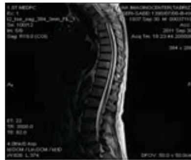
Figure 2. spinal cord MRI

Neurologic complications after cardiac surgery can occur in the post operative period. The causes of these complications are hypoxia, metabolic abnormalities, emboli, or hemorrhage. These complications can be divided into two types: type 1 (3%) includes major focal deficit and stupor or coma; type 2 (3%) includes intellectual dysfunction. These complications are associated with increased mortality, prolonged ICU stay and decreased