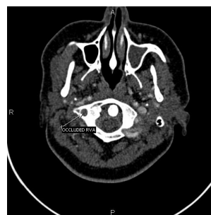
Figure 3. Axial image shows RVA occlusion.

occlusions which might occur due to hyperrotation, hyperextension, cervical traction or cervical fracture dislocation. Atlanto-occipital and atlanto-axial joints, and fifth and sixth cervical vertebrae are common sites for combined fracture dislocation and compression. Nevertheless, atlanto-occipital and atlanto-axial joints, and foramen magnum are common sites for arterial stenosis and/or occlusion caused by hyperrotation or hyperextension. Ischemic syndrome of the brain stem or spinal cord are conditions which might rise following bilateral obstruction of vertebral arteries, obstruction of a single vertebral artery combined with inadequate flow in the counterpart artery and finally, embolism, atresia or thrombosis of the posterior communicating or nearby collateral arteries. Rapid excessive rotatory movement or hyperextension of the head with no associated fracture or dislocation are scenarios following which ischemic brain stem or spinal cord syndromes might be seen. 6 Although there is no documented decisive evidence for