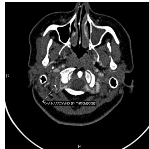
Figure 2. Axial image shows RVA narrowing and irregularity.