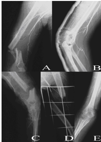
Figure 1. Angiograms of occluded brachial arteries; Occlusion of the middle third of the brachial artery together with the fracture of the distal shaft of the humerus (A); Occlusion of the distal third of the brachial artery together with the supracondylar humeral fracture after reduction (B); occlusion of the distal third of the brachial artery together with the fracture of the distal third of the humerus (C); occlusion of the proximal third of the brachial artery together with the fracture of the shaft of the humerus (D); occlusion of the distal third of the brachial artery together with the reduced dislocation of the elbow (E).