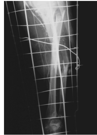
Figure 3. Angiogram of occluded ulnar artery in the middle third of the forearm. Note the fractures of the radius and ulna.

As expected, the mechanism of trauma has therapeutic implications, in blunt trauma the rate of ischemia