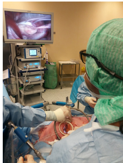
Figure 2. 3D HD video assisted mitral valve repair.

Patients' positioning, skin marking at the groins are the same as described previously. The skin incision is performed on the 2nd or 3rd right IS. The right internal mammary artery and vein are sacrificed systematically.