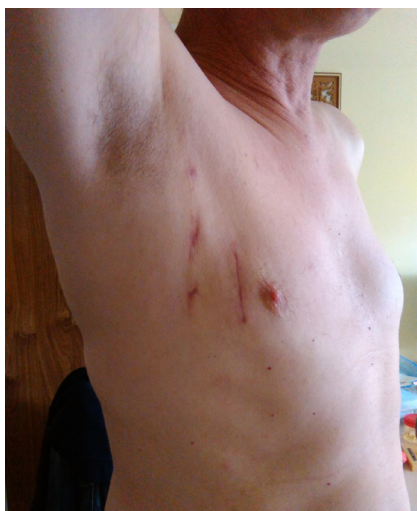
Figure 4. Post-operative scar.

femoral artery thrombosis progressively compensated by the collateral circulation. 16