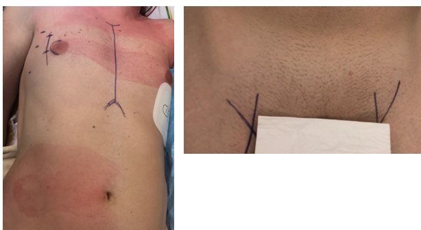
Figure 1. Skin marking.

The same approach was used for all the patients: supine position with a small roller that is longitudinally placed under the right side of the trunk. Transesophageal echocardiography is the gold standard. Defibrillation pads are placed in lateral and posterior position. Surgical landmarks at the groin and thorax are indicated by skin marker (Figure 1). The skin incision is firstly performed at the right groin on 3 cm, dissection until the femoral vessels. Then 4-6 cm incision under the inferior mammary groove through the right 4 th intercostal space. Echoguided cannulation of the femoral vein (generally 25 Fr cannula), then the femoral artery with 19 Fr cannula. In case of concomitant tricuspid valve repair, a second venous cannula is introduced into the right jugular vein. A 10-mm port is introduced through the 4 th intercostal space (IS) on the anterior axillary line for camera 3D HD Einstein Vision®. Then a 5-mm port is placed on the 5 th IS for venting. Once the cardiopulmonary bypass (CPB) is started, ventilation is stopped, the pericardium is opened and pulled by 4 pericardial traction sutures, placement of cardioplegia and aortic root sucker cannula on the ascending aortic with double purge string. The ascending aorta is directly clamped using a Chitwood or intrathoracic clamping of the aorta (Glauber – Aortic- Clamp). We